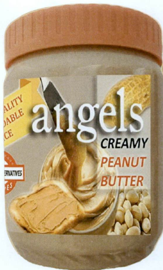
Figure 3. Unregistered ANGELS Creamy Peanut Butter