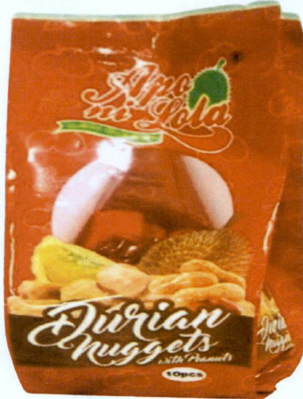
Figure 1. Unregistered APO NI LOLA Durian Nuggets with Peanuts

The Food and Drug Administration (FDA) warns all healthcare professionals and the general public NOT TO PURCHASE AND CONSUME the following unregistered food products: