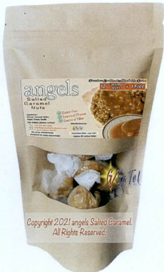
Figure 2. Unregistered ANGELS Salted Caramel Nuts