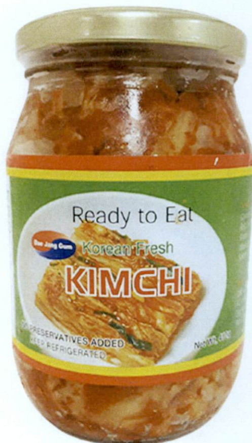
Figure 5. Unregistered DAE JANG GUM Ready to Eat Korean Fresh Kimchi