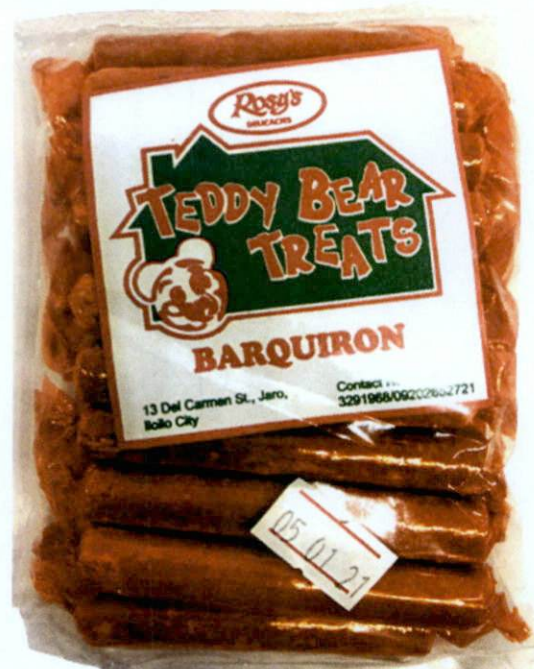
Figure 1. Unregistered ROSY'S DELICACIES Teddy Bear Treats Barquiron

The Food and Drug Administration (FDA) warns all healthcare professionals and the general public NOT TO PURCHASE AND CONSUME the following unregistered food products: