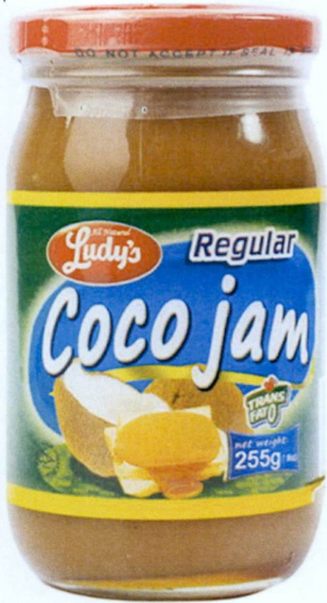
Figure 2. Unregistered LUDY'S Regular Coco Jam