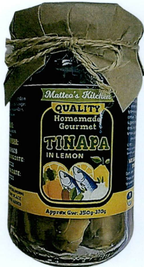
Figure 3. Unregistered MATTEO'S KITCHEN Quality Homemade Gourmet Tinapa in Lemon