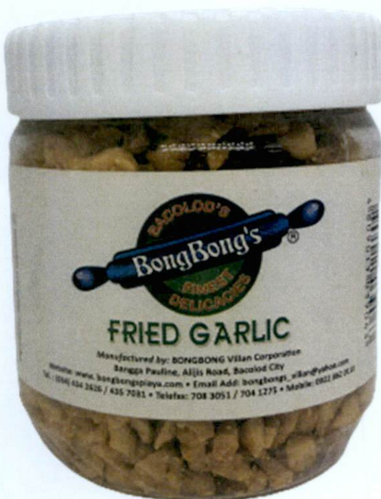
Figure 4. Unregistered BONBONG'S Fried Garlic