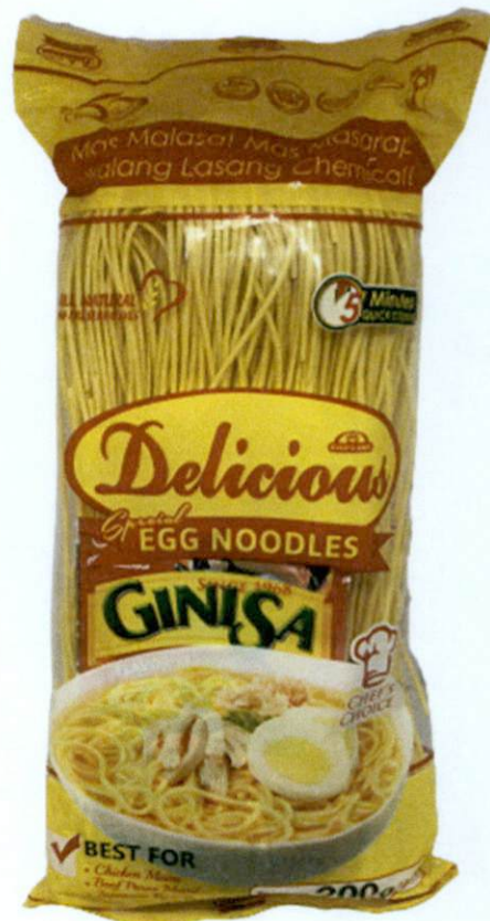
Figure 5. Unregistered GOLD LABEL DELICIOUS Special Egg Noodles