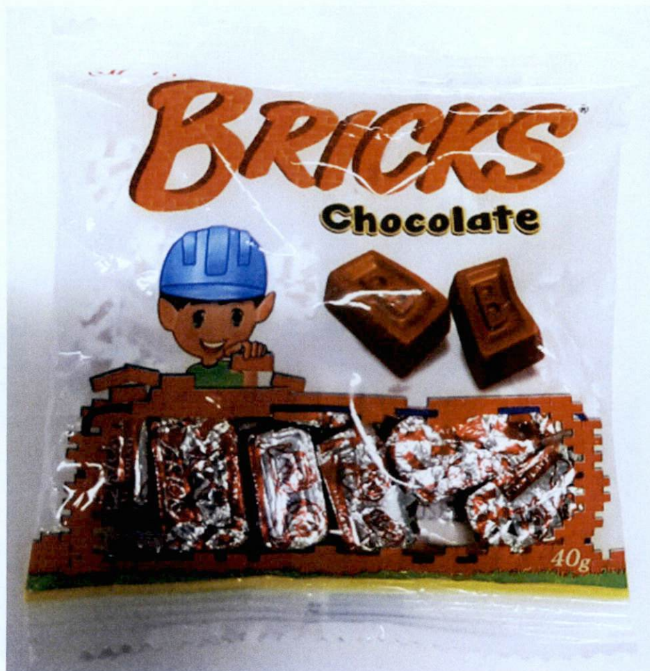
Figure 1. The Approved label of MAYFAIR Bricks Chocolate , 40g with registration number FR-4000007403594 valid until 10 May 2025 .

The Food and Drug Administration (FDA) informs the public that the food product MAYFAIR Bricks Chocolate has been registered by the Market Authorization Holder (MAH) TWIN OAKS FOODS CORPORATION in accordance to existing FDA rules and regulations.