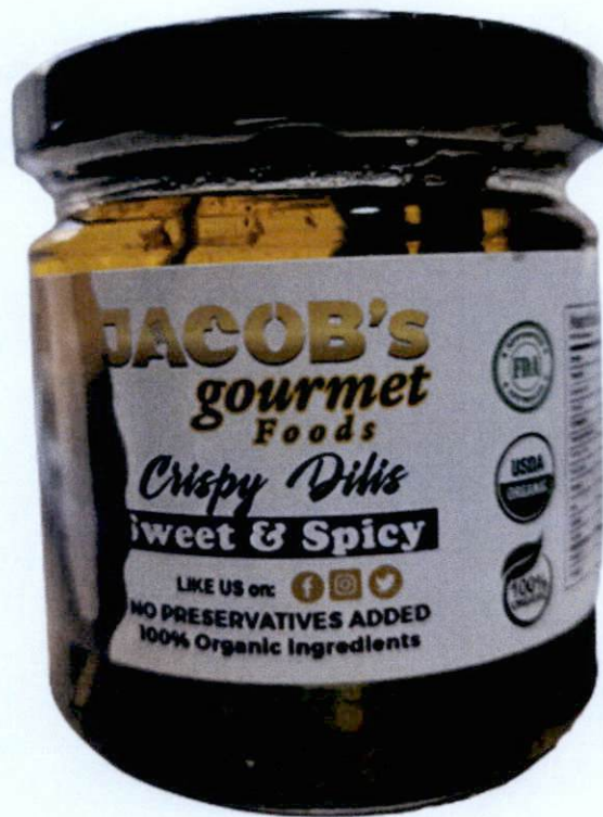
Figure 2. Unregistered JACOB'S GOURMET FOODS Dilis Sweet & Spicy