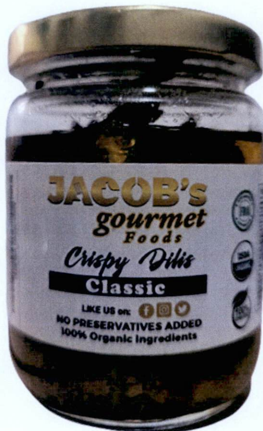
Figure 3. Unregistered JACOB'S GOURMET FOODS Crispy Dilis Classic