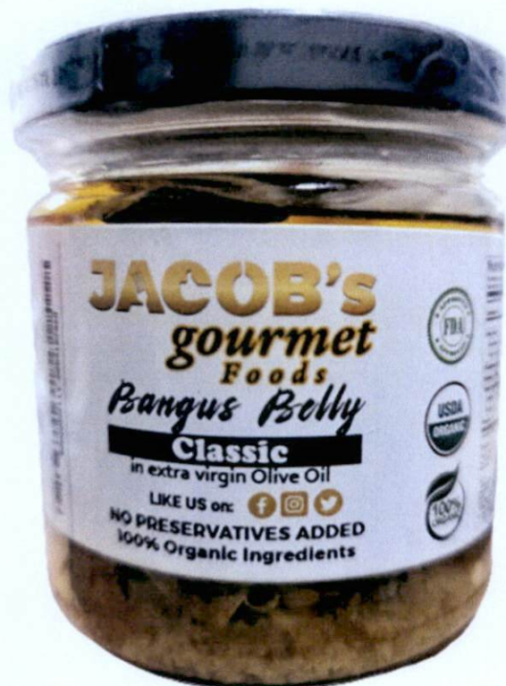
Figure 1. Unregistered JACOB'S GOURMET FOODS Bangus Belly Classic in Extra Virgin Olive Oil

The Food and Drug Administration (FDA) warns all healthcare professionals and the general public NOT TO PURCHASE AND CONSUME the following unregistered food products: