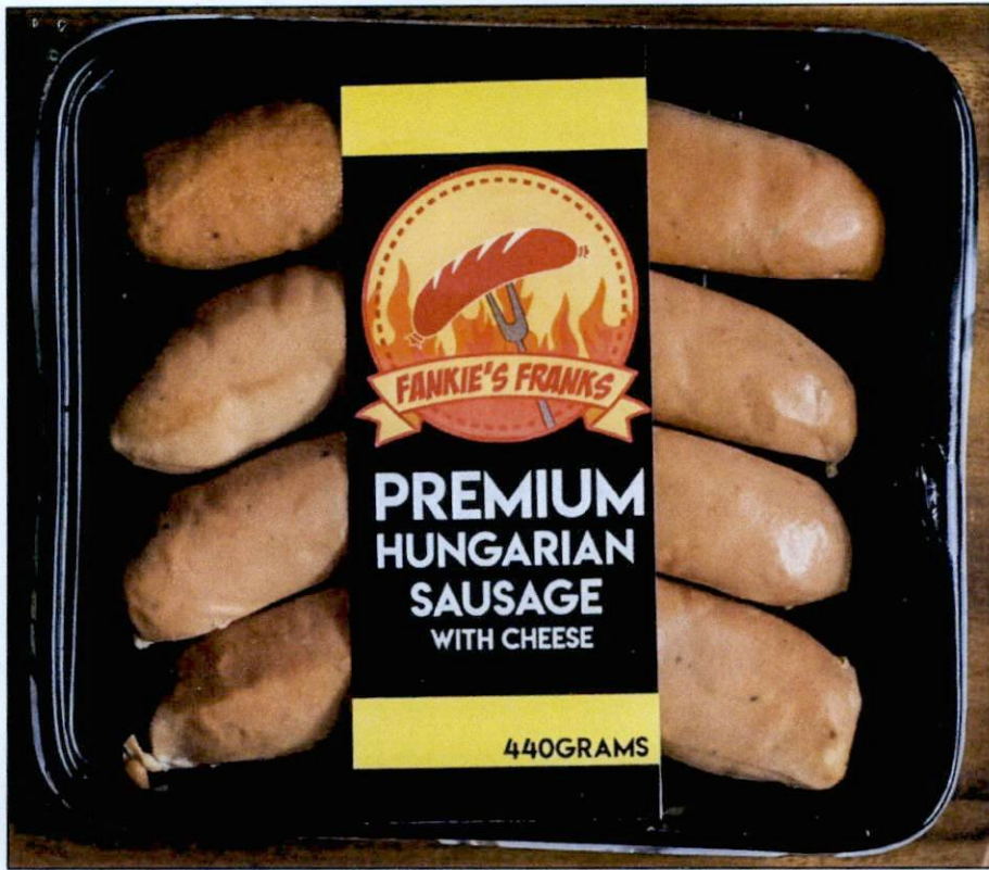
Figure 4. Unregistered FANKIE'S FRANKS Premium Hungarian Sausage with Cheese