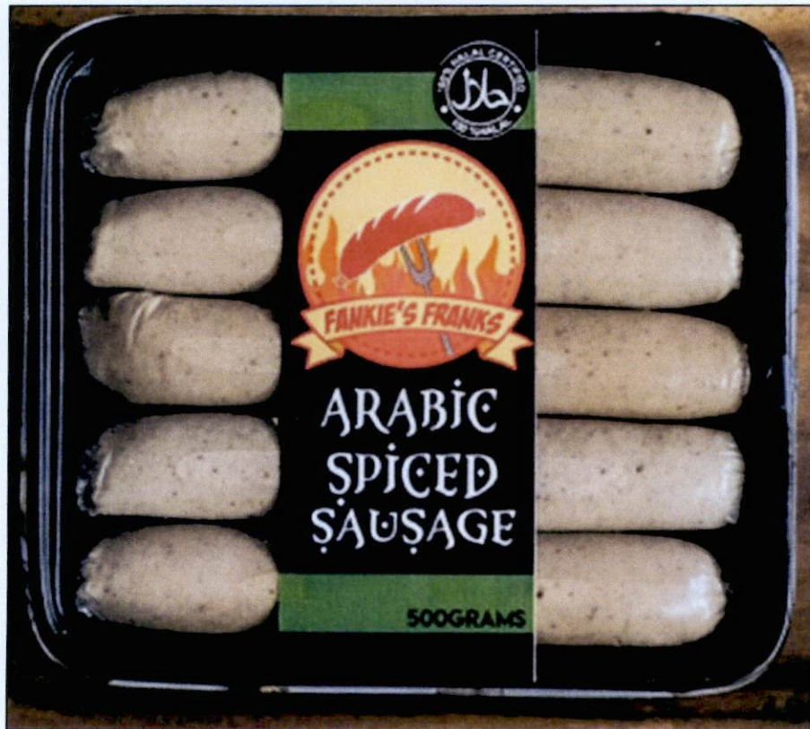
Figure 5. Unregistered FANKIE'S FRANKS Arabic Spiced Sausage