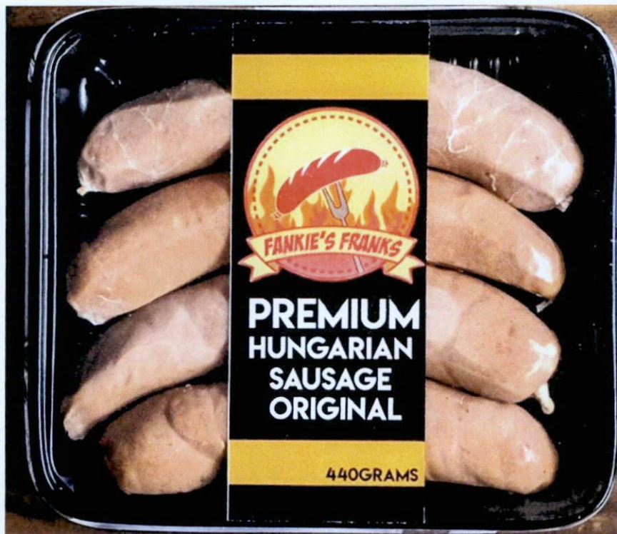
Figure 3. Unregistered FANKIE'S FRANK Premium Hungarian Sausage Original