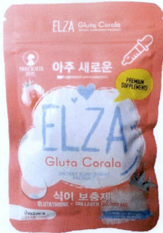
Figure 4. Unregistered ELZA Gluta Corala Dietary Supplement