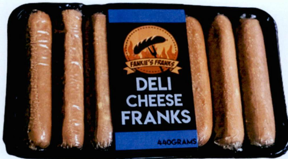
Figure 1. Unregistered FANKIE'S FRANK Deli Cheese Franks

The Food and Drug Administration (FDA) warns all healthcare professionals and the general public NOT TO PURCHASE AND CONSUME the following unregistered food products and food supplements: