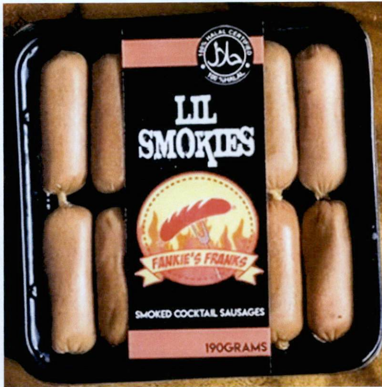
Figure 2. Unregistered FANKIE'S FRANK LIL SMOKIES Smoked Cocktail Sausages