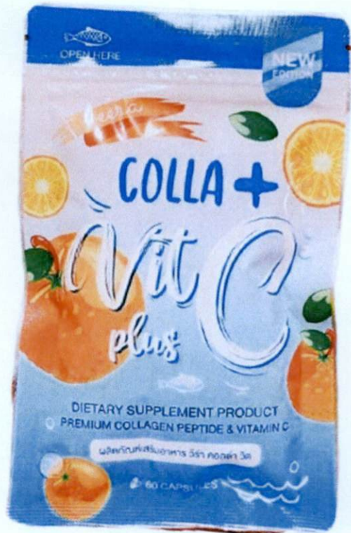
Figure 3. Unregistered COLLA+ VIT C PLUS Premium Collagen Peptide & Vitamin C Dietary Supplement Product