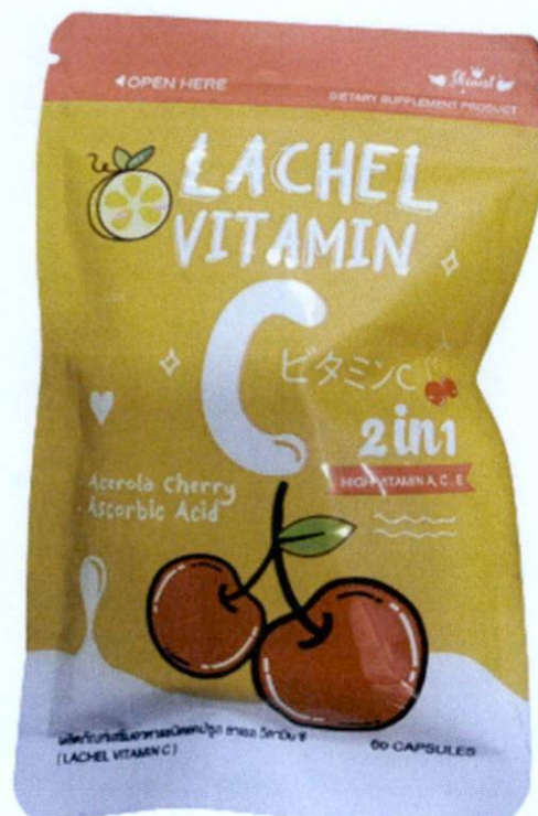
Figure 1. Unregistered LACHEL VITAMIN C 2 in 1 Highvitamin A, C, E Dietary Supplement Product

The Food and Drug Administration (FDA) warns all healthcare professionals and the general public NOT TO PURCHASE AND CONSUME the following unregistered food supplements: