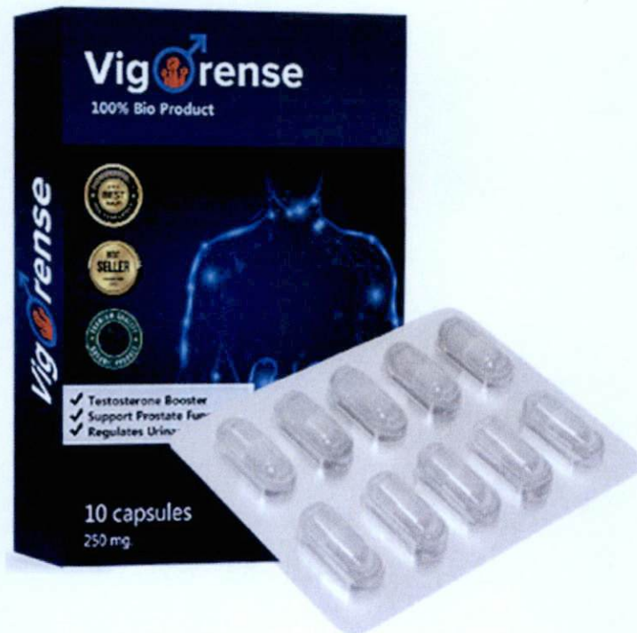
Figure 4. Unregistered VIGORENSE 100% Bio Product 10 capsule, 250mg