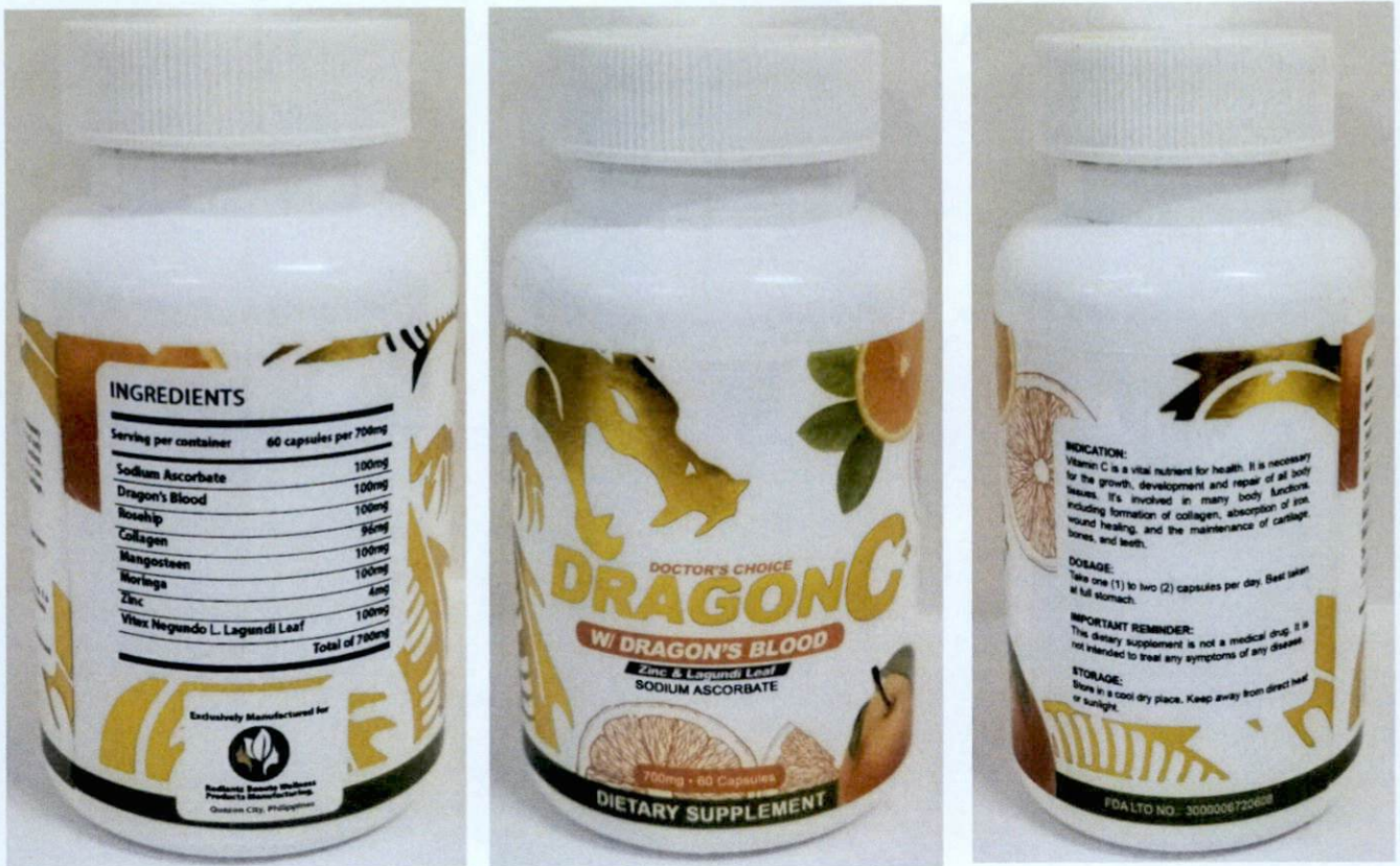
Figure 5. Unregistered DOCTOR'S CHOICE DRAGONC+ Zinc & Lagundi Leaf Sodium Ascorbate Dietary Supplement

The FDA verified through online monitoring or post-marketing surveillance that the abovementioned food supplements are not registered and no corresponding Certificates of Product Registration (CPR) have been issued. Pursuant to the Republic Act No. 9711, otherwise known as the “Food and Drug Administration Act of 2009”, the manufacture, importation, exportation, sale, offering for sale, distribution, transfer, non-consumer use, promotion, advertising or sponsorship of health products without the proper authorization is prohibited.