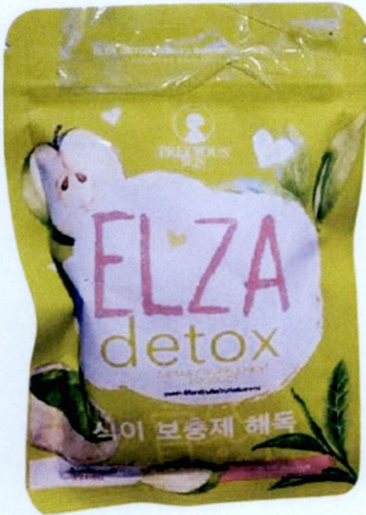
Figure 2. Unregistered ELZA DETOX Dietary Supplement Product