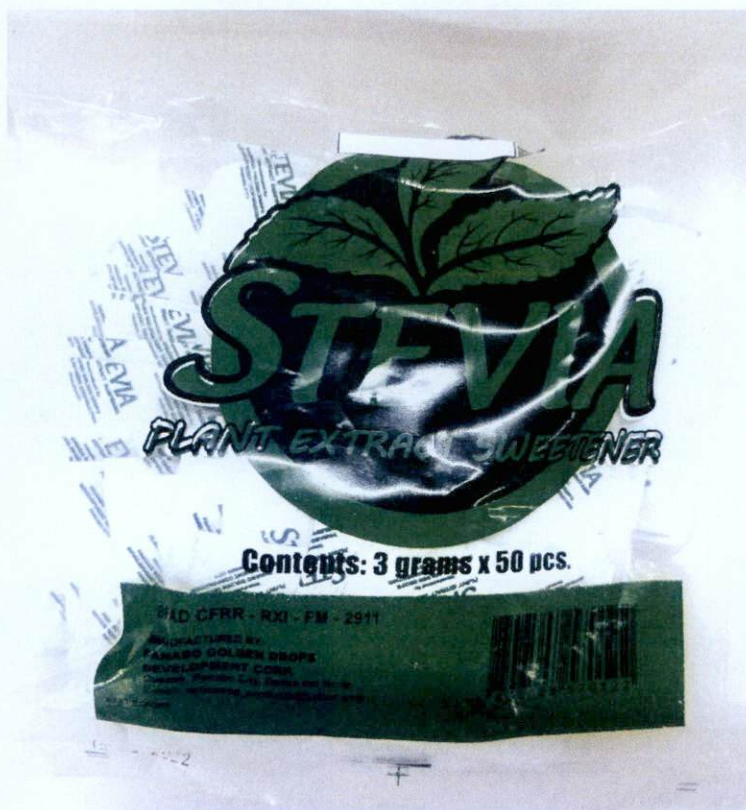
Figure 5. Unregistered Stevia Plant Extract Sweetener