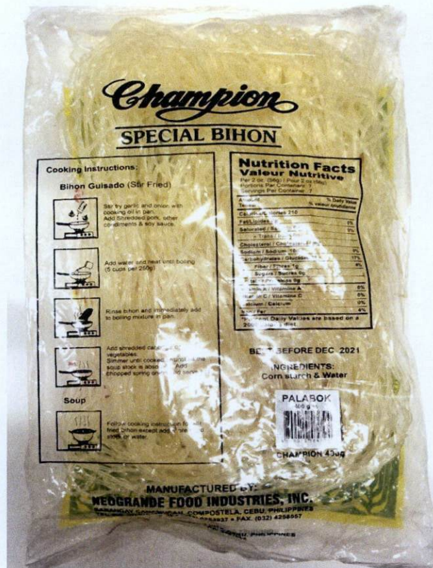
Figure 4. Unregistered CHAMPION Special Palabok