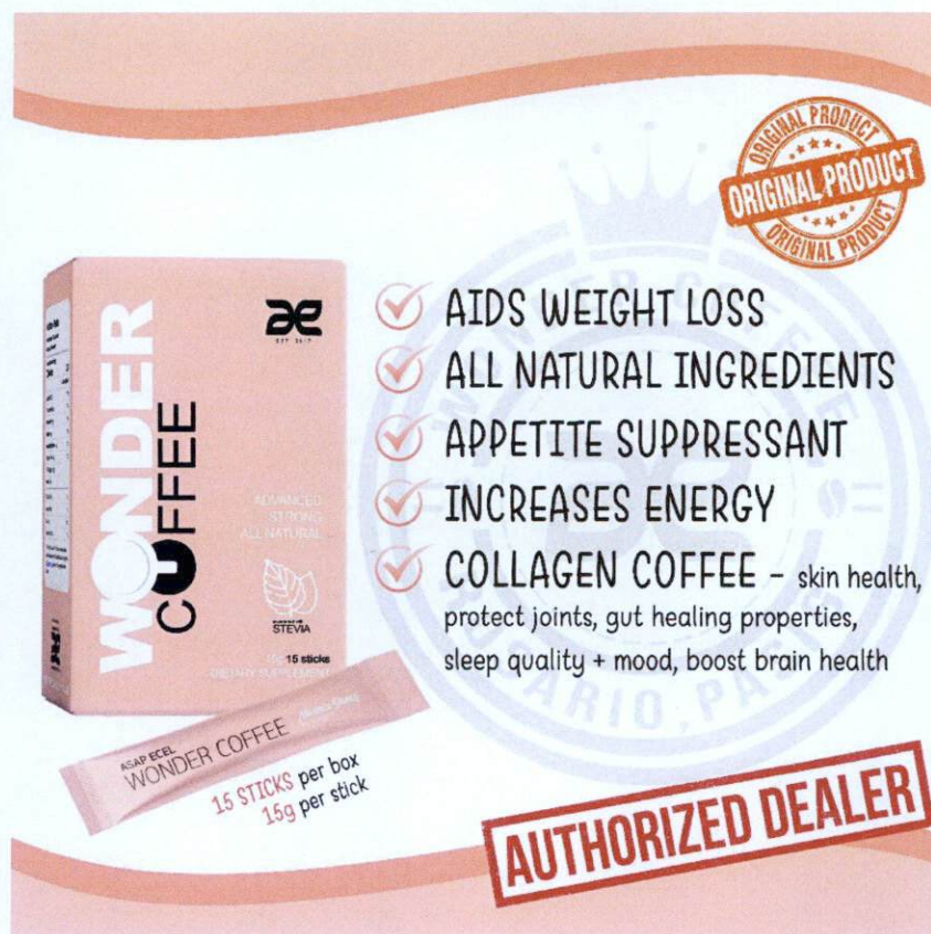
Figure 1. Unregistered ASAP ECEL Wonder Coffee

The Food and Drug Administration (FDA) warns all healthcare professionals and the general public NOT TO PURCHASE AND CONSUME the following unregistered food products: