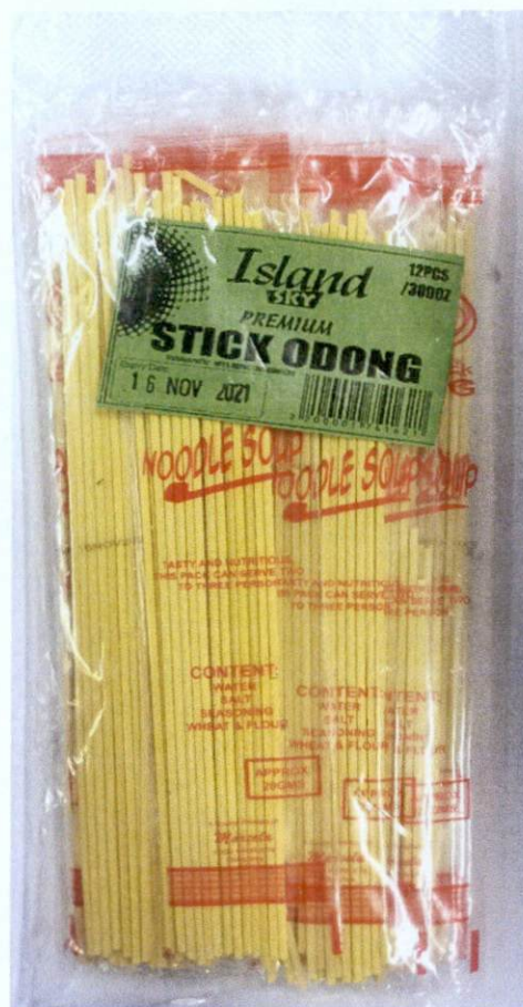
Figure 3. Unregistered ISLAND SKY Premium Stick Odong