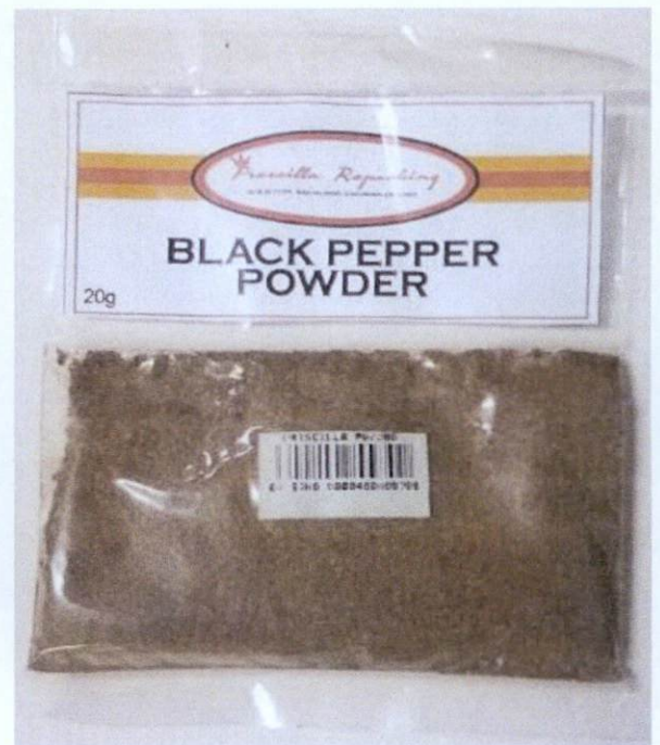
Figure 5. Unregistered PRESCILLA REPACKING Black Pepper Powder