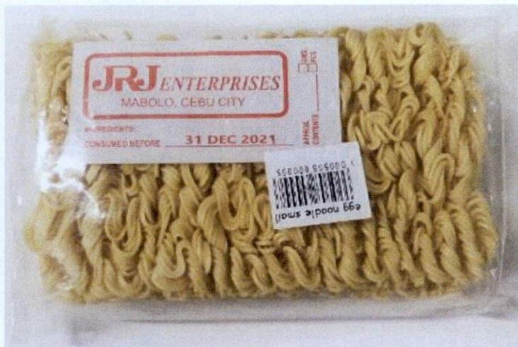
Figure 4. Unregistered JRJ ENTERPRISES Egg Noodle Small