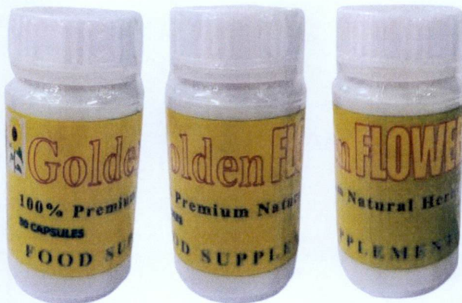
Figure 1. Unregistered GOLDEN FLOWER 100% Premium Natural Herbs Food Supplement

The Food and Drug Administration (FDA) warns all healthcare professionals and the general public NOT TO PURCHASE AND CONSUME the following unregistered food supplement and food products: