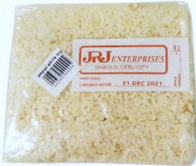
Figure 2. Unregistered JRJ ENTERPRISES Ampao White Big