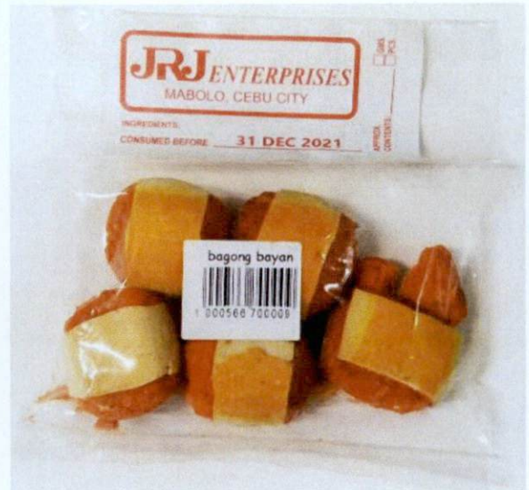
Figure 3. Unregistered JRJ ENTERPRISES Bagong Bayan