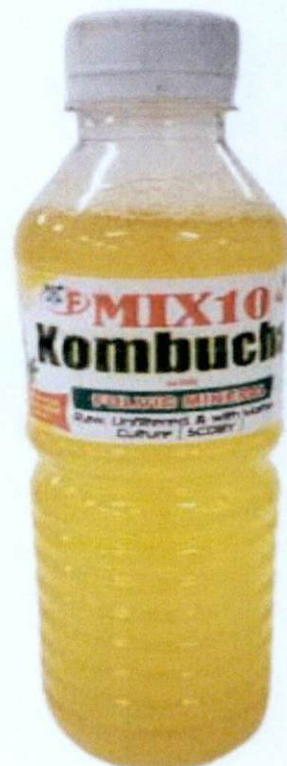
Figure 5. Unregistered DOK F Mix 10 Kombucha with Fulvic Minerals