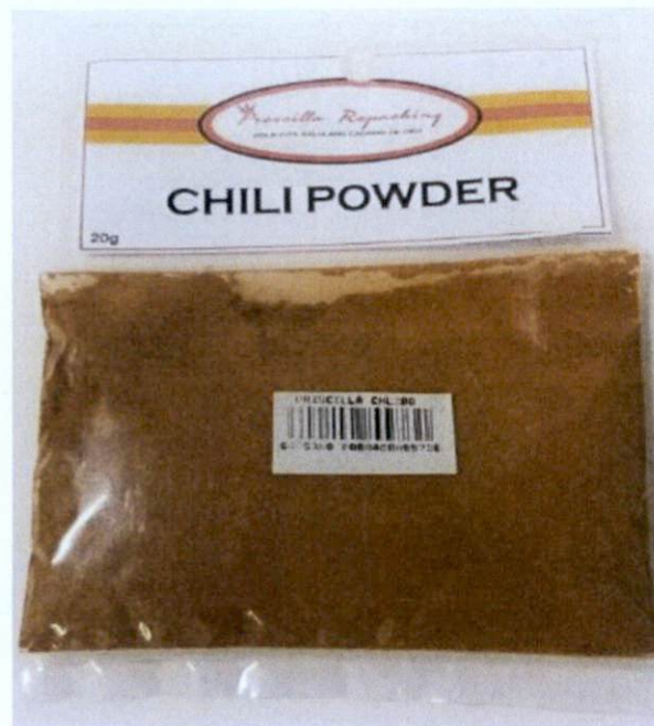
Figure 1. Unregistered PRESCILLA REPACKING Chili Powder

The Food and Drug Administration (FDA) warns all healthcare professionals and the general public NOT TO PURCHASE AND CONSUME the following unregistered food products: