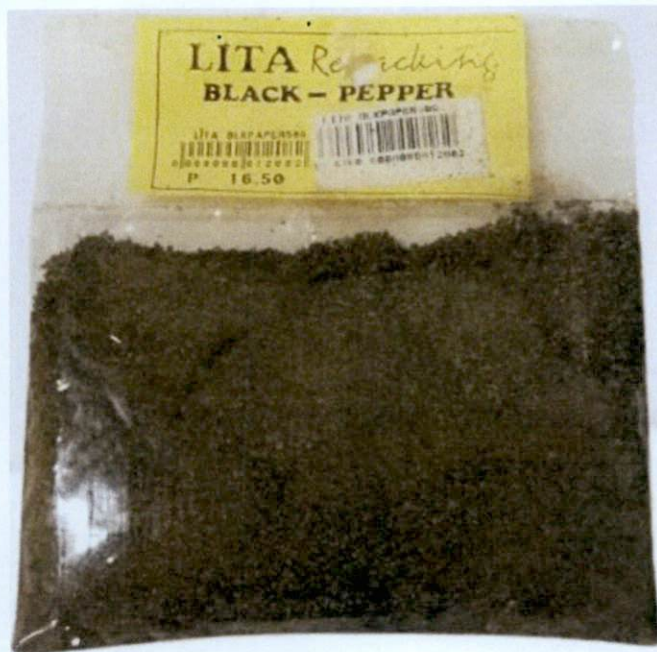
Figure 2. Unregistered LITA REPACKING Black Pepper