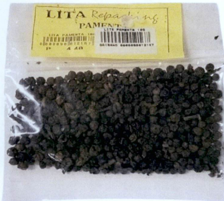
Figure 4. Unregistered LITA REPACKING Pamenta