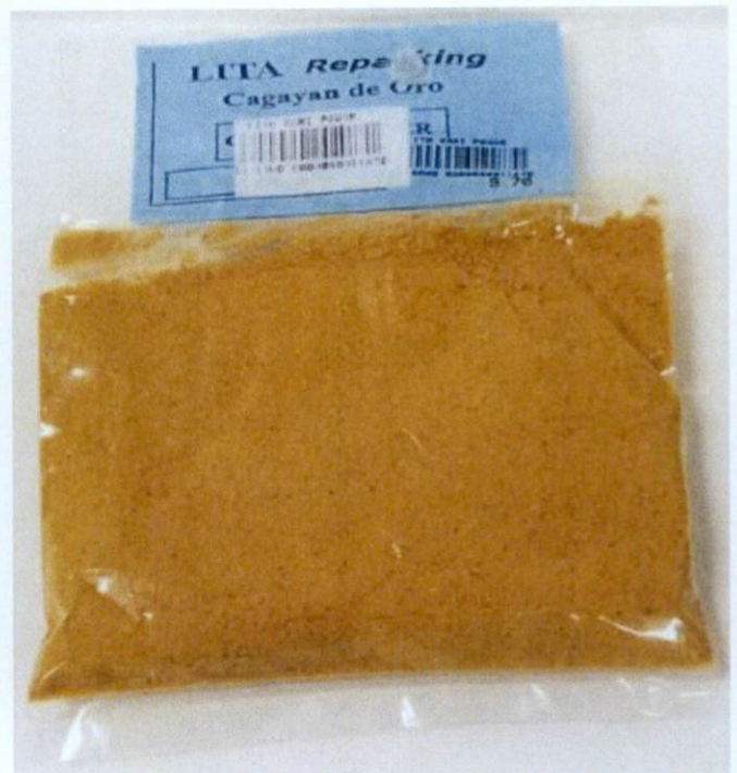
Figure 3. Unregistered LITA REPACKING Curry Powder