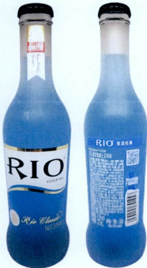
Figure 4. Unregistered RIO Cocktail Rio Classic Rose + Whisky Flavour (In Foreign Language)