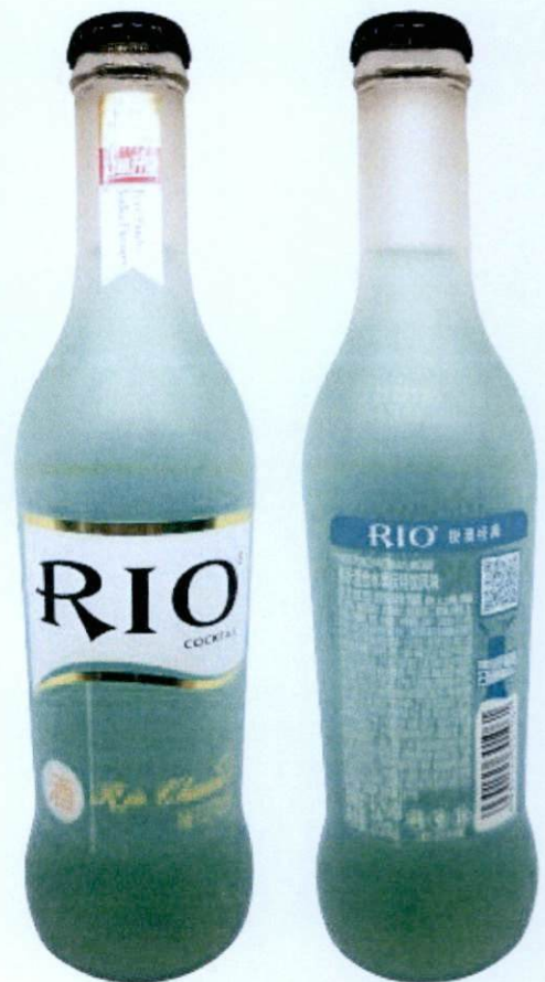
Figure 5. Unregistered RIO Cocktail Rio Classic Fruit Punch + Vodka Flavour (In Foreign Language)