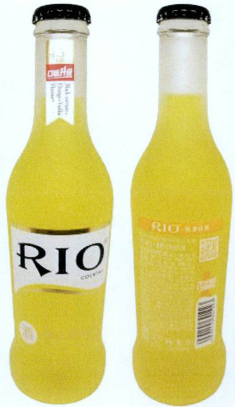
Figure 3. Unregistered RIO Cocktail Rio Classic Black Currant + Orange + Vodka Flavour (In Foreign Language)