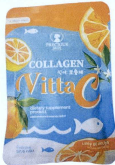
Figure 1. Unregistered PRECIOUS SKIN THAILAND Collagen Vitta C Dietary Supplement Product

The Food and Drug Administration (FDA) warns all healthcare professionals and the general public NOT TO PURCHASE AND CONSUME the following unregistered food supplement and food products: