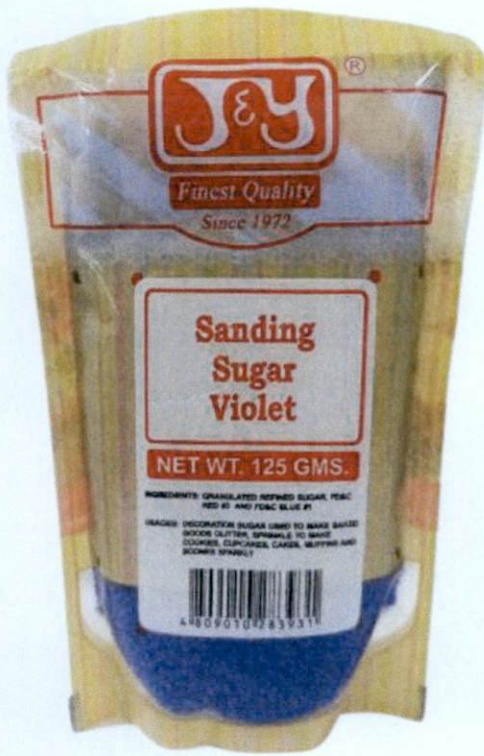
Figure 2. Unregistered J & Y Sanding Sugar Violet