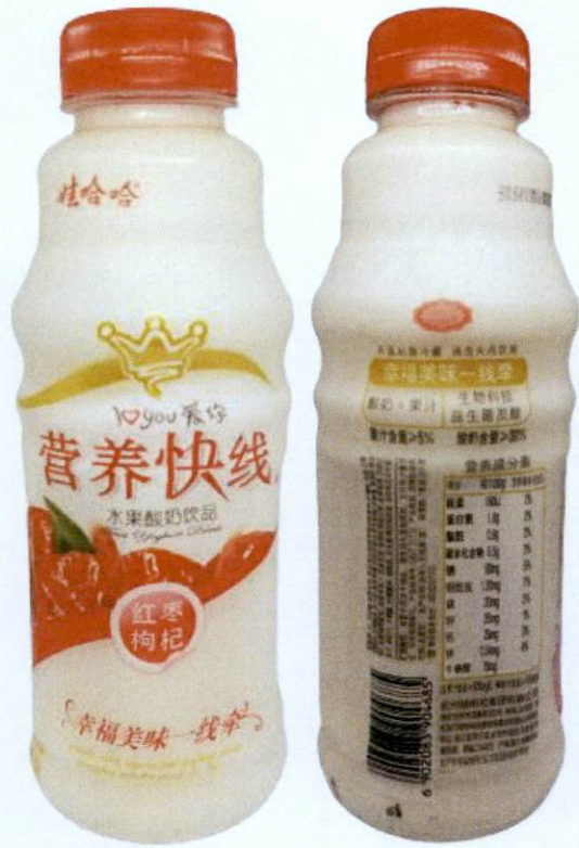
Figure 3. Unregistered I (Heart) YOU Fruit Yoghurt Drink in PET Bottle with red label (In Foreign Language)