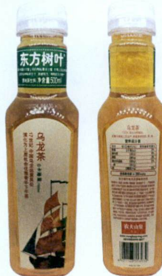
Figure 1. Unregistered Yellow-brown beverage in transparent bottle with green label and traditional ship image (In Foreign Language)

The Food and Drug Administration (FDA) warns all healthcare professionals and the general public NOT TO PURCHASE AND CONSUME the following unregistered food products: