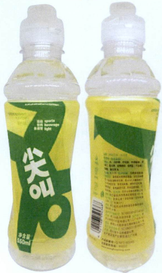
Figure 5. Unregistered SPORTS BEVERAGE LIGHT Green Mango Flavor (In Foreign Language)