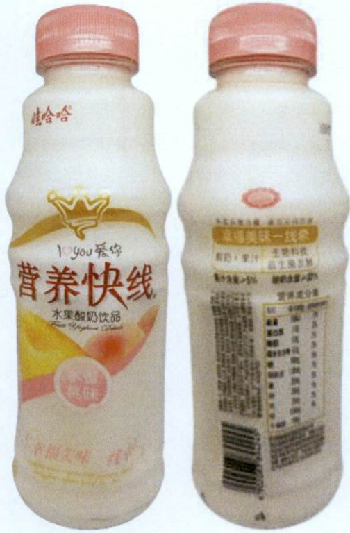
Figure 2. Unregistered I (Heart) YOU Fruit Yoghurt Drink in PET Bottle with pink label (In Foreign Language)