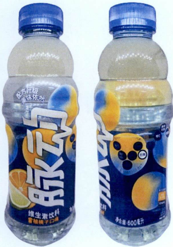
Figure 4. Unregistered LIVE ENHANCE Drink in PET Bottle with Calamansi & Orange Image (In Foreign Language)