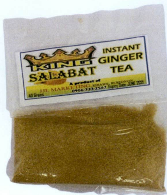
Figure 5. Unregistered KING SALABAT Instant Ginger Tea