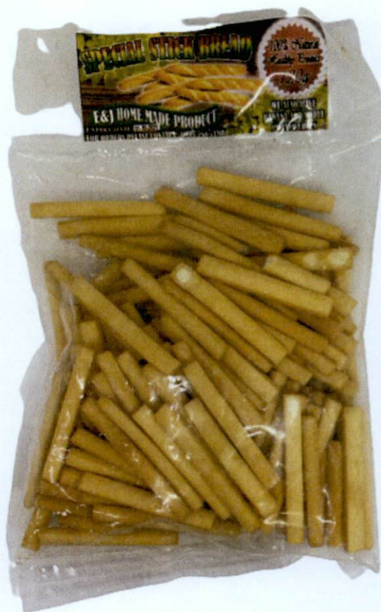
Figure 3. Unregistered F&J HOME MADE PRODUCT Special Stick Bread