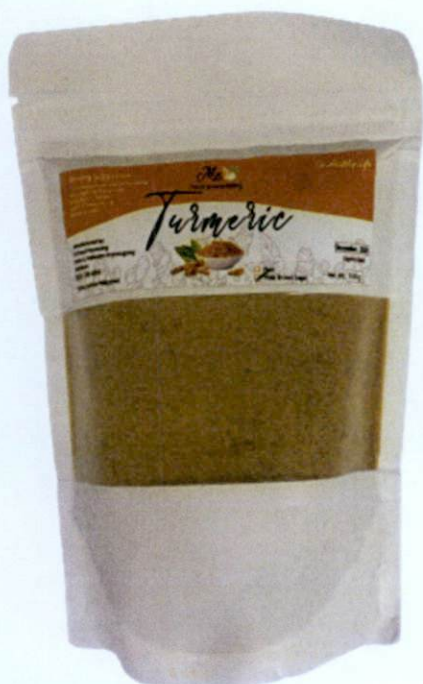
Figure 4. Unregistered ME FOOD PROCESSING Turmeric, 100 g