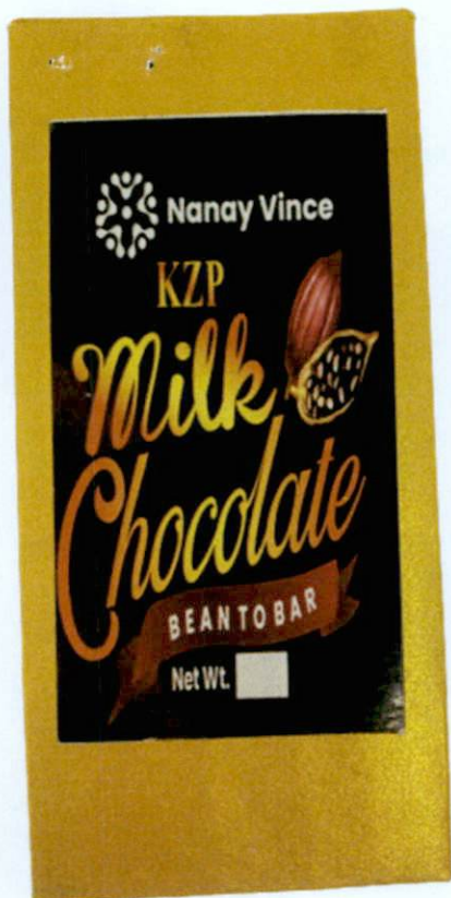
Figure 2. Unregistered NANAY VINCE KZP Milk Chocolate