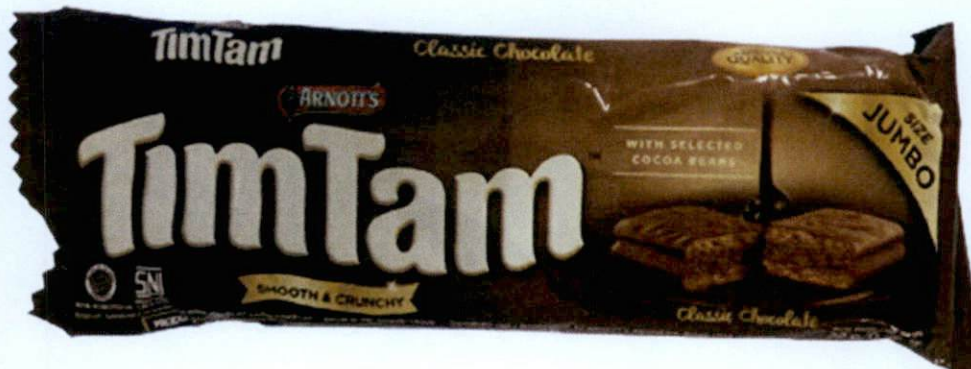
Figure 3. Unregistered ARNOTT'S Tim Tam Classic Chocolate with Selected Cocoa Beans, 22 g

The Food and Drug Administration (FDA) warns all healthcare professionals and the general public NOT TO PURCHASE AND CONSUME the following unregistered food products: