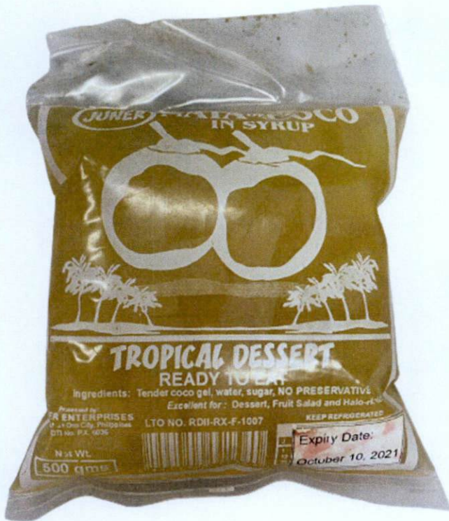
Figure 2. JUNER Nata De Coco in Syrup, 500 g