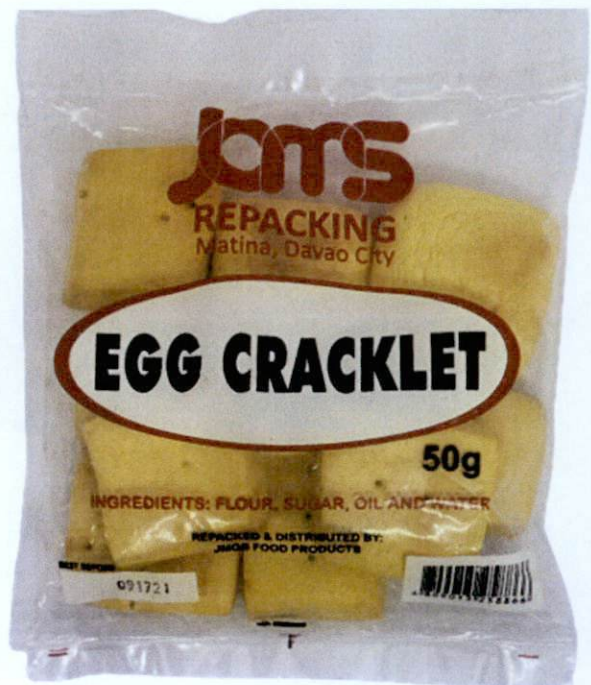
Figure 5. Unregistered JAMS Egg Cracklet, 50 g