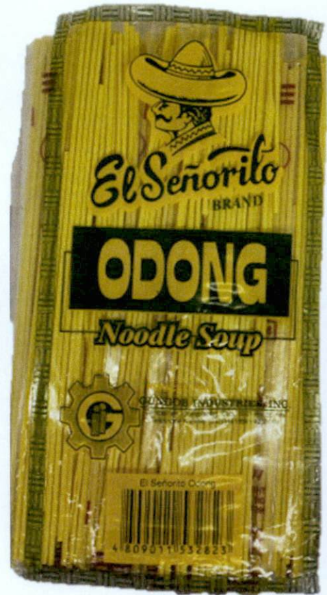
Figure 3. Unregistered EL SEÑORITO BRAND Odong Noodle Soup