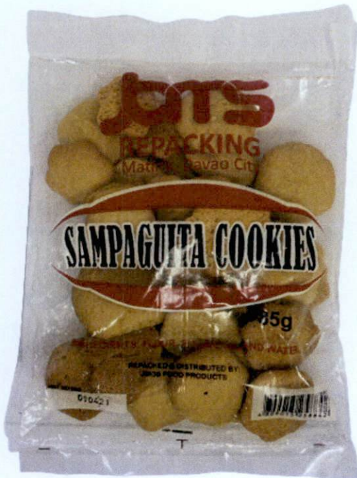
Figure 4. Unregistered JAMS Sampaguita Cookies, 85 g