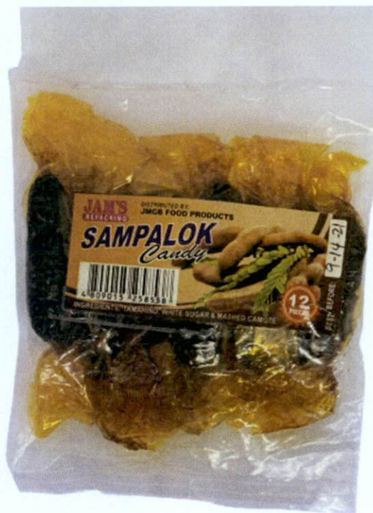
Figure 1. Unregistered JAM'S Sampalok Candy

The Food and Drug Administration (FDA) warns all healthcare professionals and the general public NOT TO PURCHASE AND CONSUME the following unregistered food products: