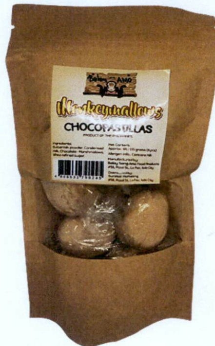
Figure 1. Unregistered MONKEYMALLOWS Chocopastillas

The Food and Drug Administration (FDA) warns all healthcare professionals and the general public NOT TO PURCHASE AND CONSUME the following unregistered food products: