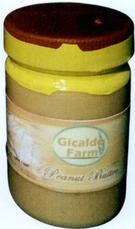
Figure 3. Unregistered GICALDE FARM Peanut Butter