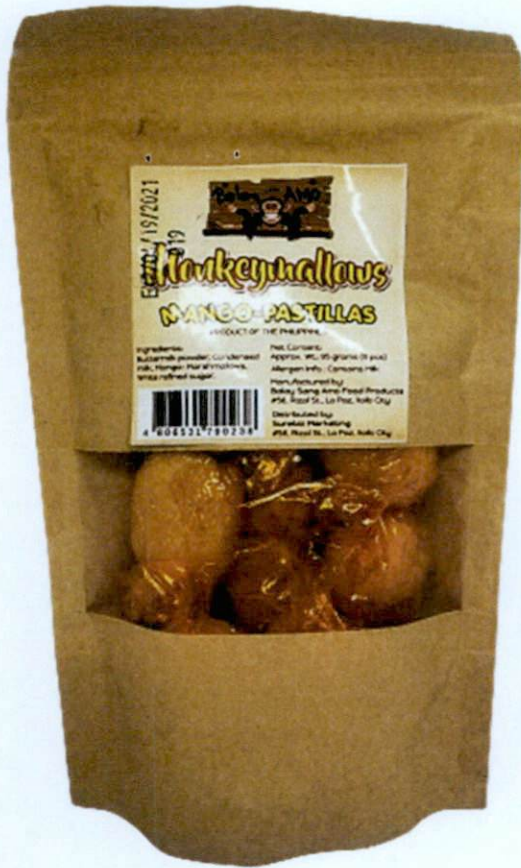
Figure 2. Unregistered MONKEYMALLOWS Mango-Pastillas