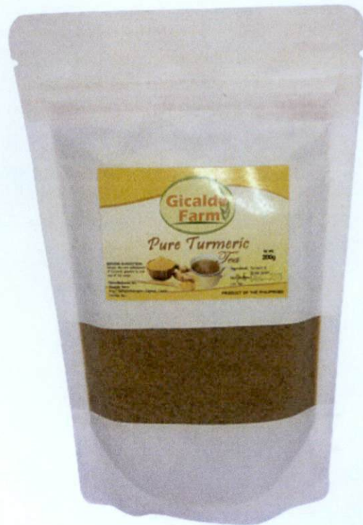
Figure 5. Unregistered GICALDE FARM Pure Turmeric Tea