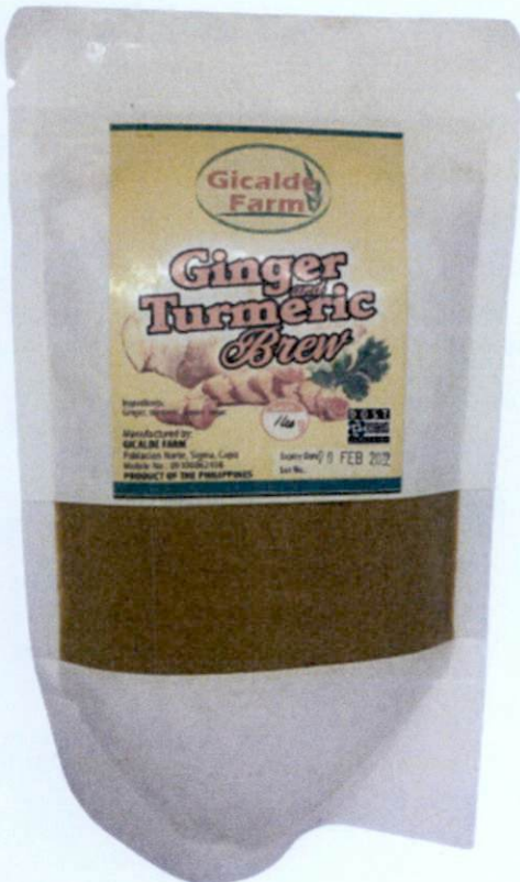
Figure 4. Unregistered GICALDE FARM Ginger and Turmeric Brew