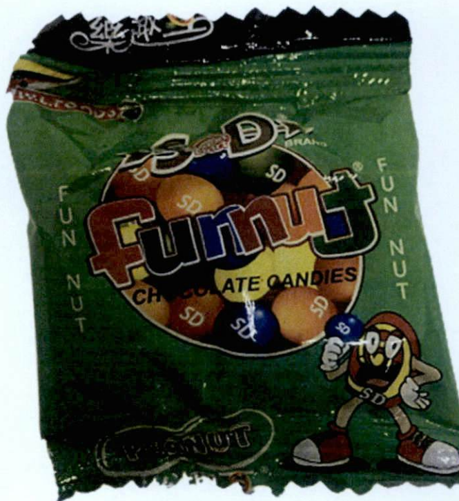
Figure 5. Unregistered SWEET DART Fun Nut Peanut Chocolate Candies