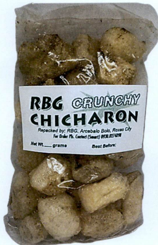
Figure 3. Unregistered RBG Crunchy Chicharon