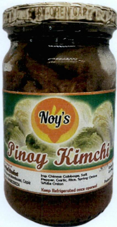
Figure 2. Unregistered NOY'S Pinoy Kimchi