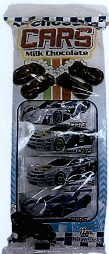
Figure 4. Unregistered CHOCO CARS Milk Chocolate