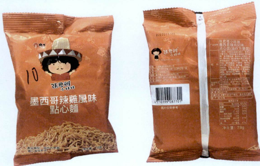
Figure 1. Unregistered WEI LIH Noodle Snack in Orange Plastic Packaging (In Foreign Language)

The Food and Drug Administration (FDA) warns all healthcare professionals and the general public NOT TO PURCHASE AND CONSUME the following unregistered food products: