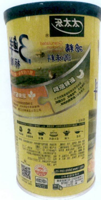
Figure 3. Unregistered Granulated Chicken Bouillon in Yellow Tin Can (In Foreign Language)