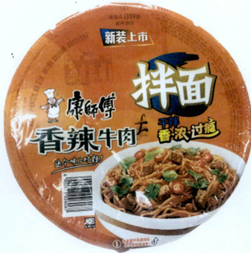
Figure 4. Unregistered Instant Noodle with Red Chili Pepper and Meat in Round Orange Plastic Container (In Foreign Language)