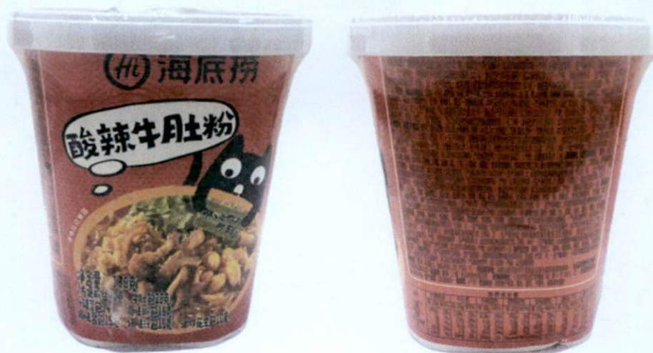
Figure 1. Unregistered HI Instant Noodle with Black Cat Character in Red Paper Cup (In Foreign Language)

The Food and Drug Administration (FDA) warns all healthcare professionals and the general public NOT TO PURCHASE AND CONSUME the following unregistered food products: