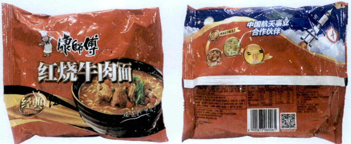
Figure 5. Unregistered Braised Beef Noodle in Red Plastic Pouch (In Foreign Language)