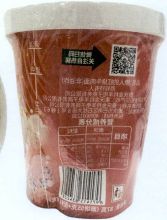
Figure 2. Unregistered Instant Noodle with Animal Characters in Pink Paper Cup (In Foreign Language)