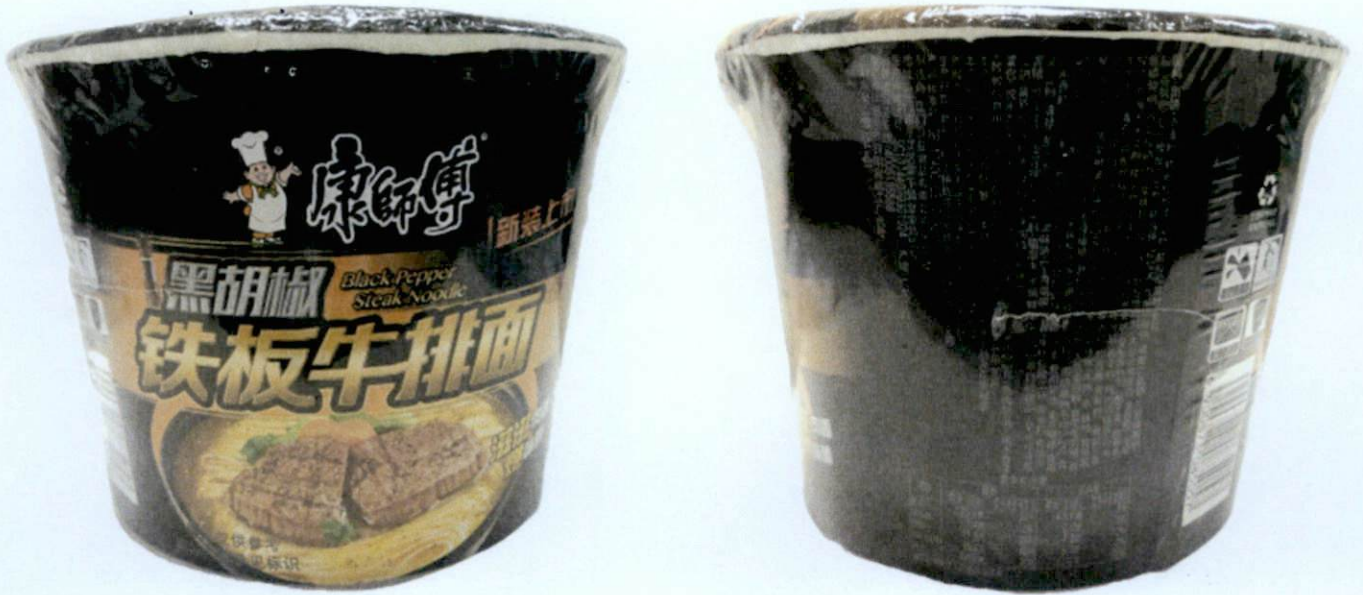
Figure 4. Unregistered Black Pepper Steak Noodle (In Foreign Language)