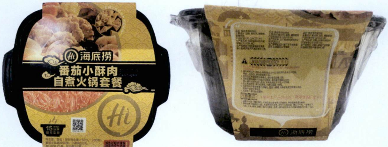
Figure 1. Unregistered HI Instant Noodle in Black Container with Breaded Meat and Vegetables (In Foreign Language)

The Food and Drug Administration (FDA) warns all healthcare professionals and the general public NOT TO PURCHASE AND CONSUME the following unregistered food products: