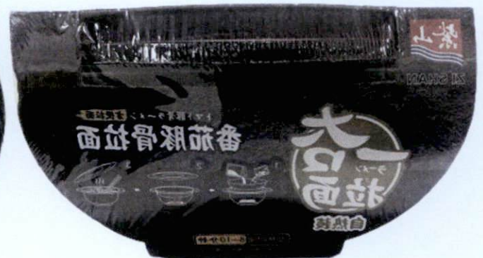
Figure 3. Unregistered ZI SHAN Instant Noodle in Black Container with Egg, Meat and Tomato (In Foreign Language)