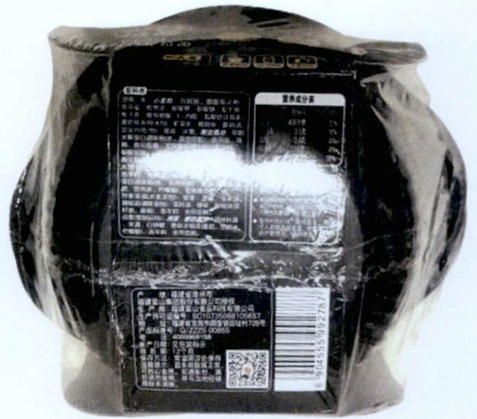
Figure 2. Unregistered ZI SHAN Instant Noodle in Black Container with Egg, Meat and Chili (In Foreign Language)