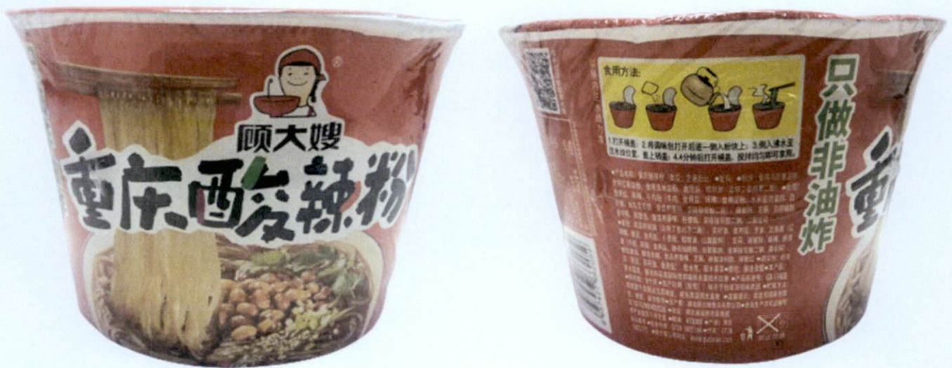
Figure 5. Unregistered Instant Noodle with beans in Red Paper Cup (In Foreign Language)