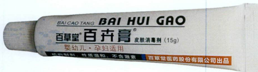
Bct Bai Cao Tang Bai Hui Gao 15g