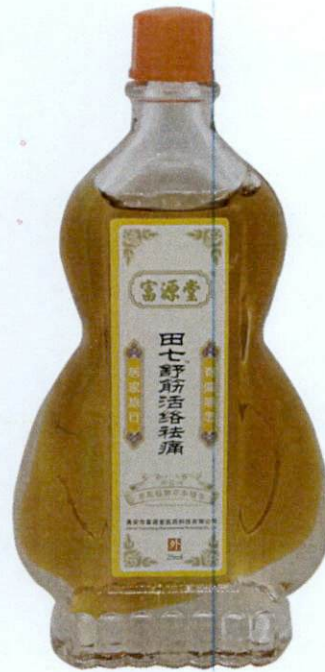
Extraction Herbaceous Essense 25mL by: Gao'an Fuyuantang Pharmaceutical Technology Co., Ltd.