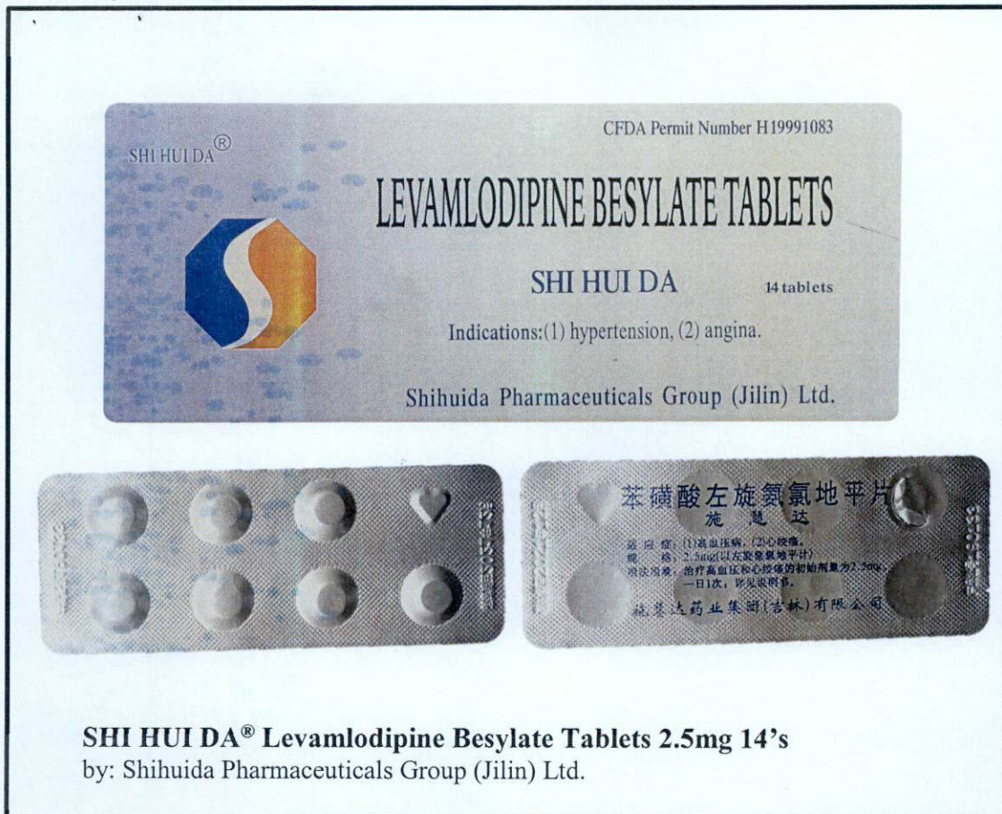
SHI HUI DA® Levamlodipine Besylate Tablets 2.5mg 14's by: Shihuida Pharmaceuticals Group (Jilin) Ltd.