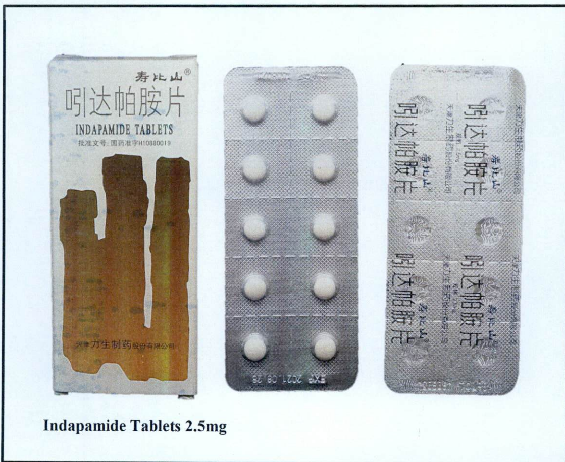
Figure 5. Unregistered drug product