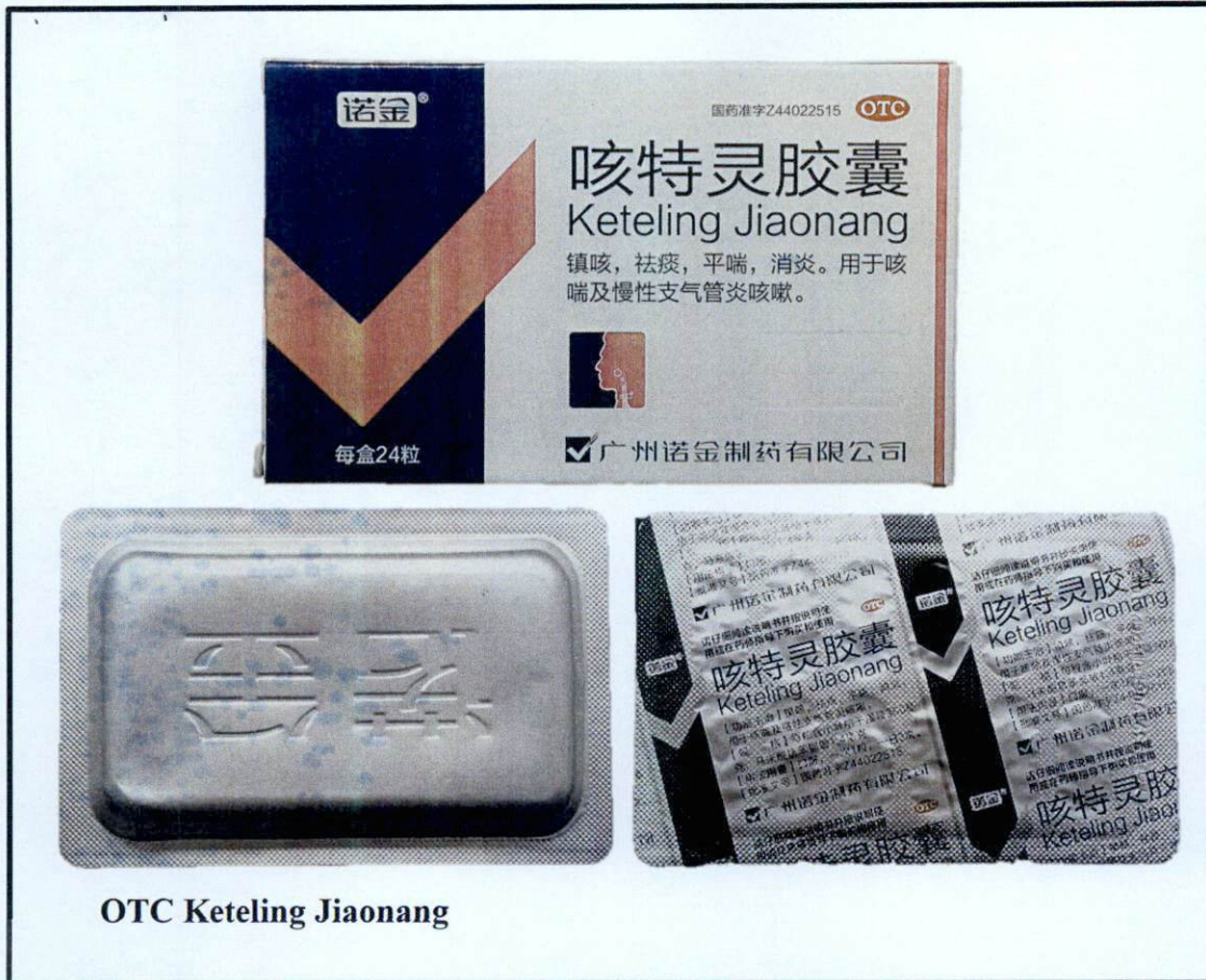
Figure 4. Unregistered drug product