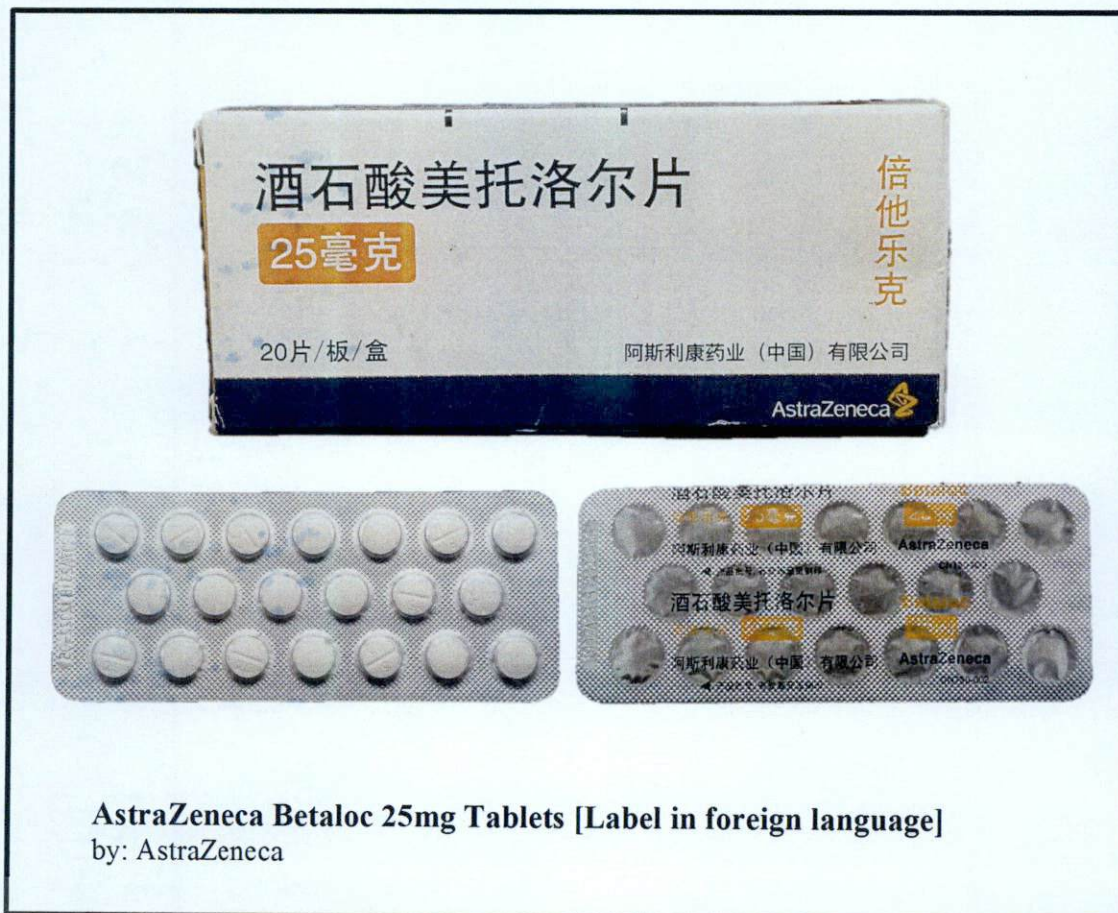
AstraZeneca Betaloc 25mg Tablets [Label in foreign language] by: AstraZeneca