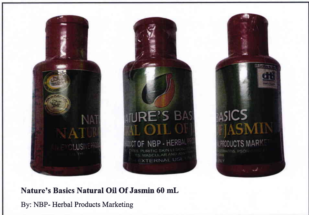
Nature's Basics Natural Oil Of Jasmin 60 mL