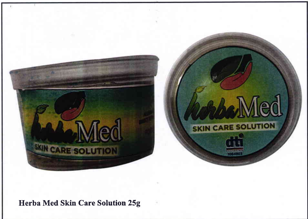
Herba Med Skin Care Solution 25g