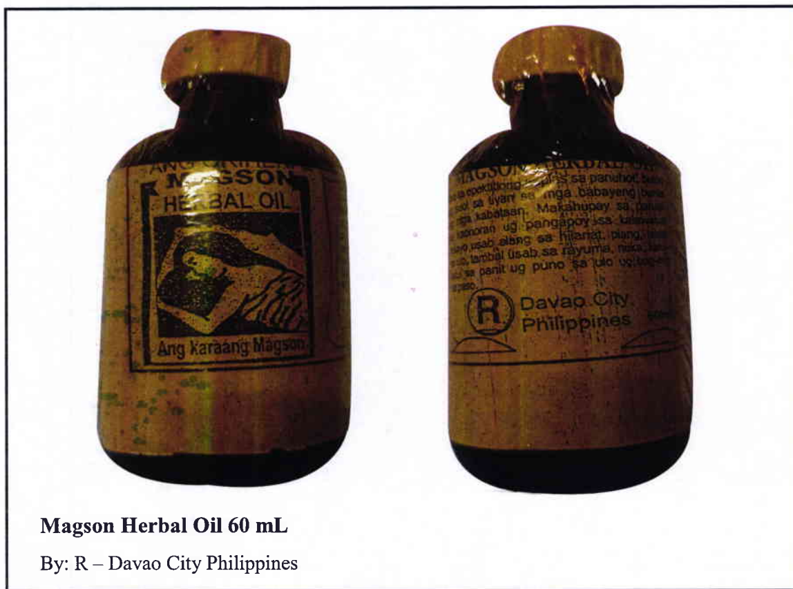
Figure 4. Unregistered drug product

FDA Post-Marketing Surveillance (PMS) activities have verified that the abovementioned drug products have not gone through the registration process of the Agency and have not been issued with proper authorization in the form of Certificate of Product Registration. Thus, the Agency cannot guarantee its quality, safety and efficacy. Therefore, consumption of such violative products may pose potential danger or injury to health.