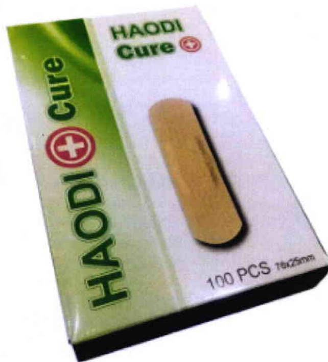
Figure 1. Unnotified Haodi Cure Bandaid Plaster

The Food and Drug Administration (FDA) warns all healthcare professionals and the general public NOT TO PURCHASE AND USE the unnotified medical device products: