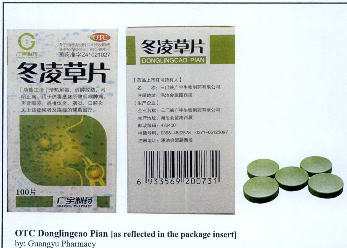
Figure 1. Unregistered drug product

The Food and Drug Administration (FDA) advises the public against the purchase and use of the following unregistered drug products: