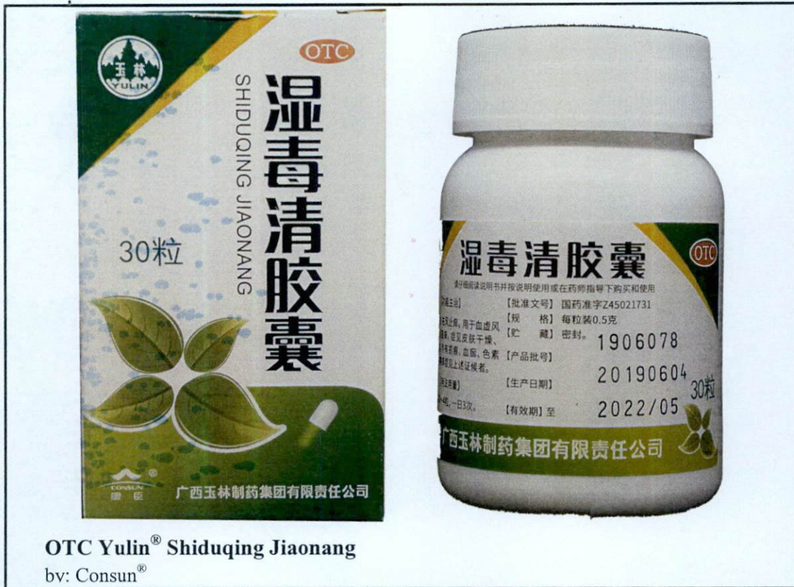
OTC Yulin ® Shiduqing Jiaonang by: Consun ®