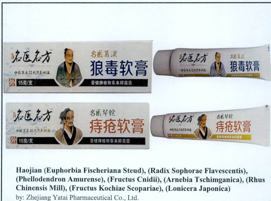
Figure 5. Unregistered drug product