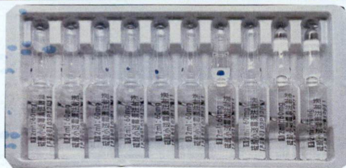
Micronomicin Sulfate Injection 2ml: 60mg [Label in Foreign Language] by: Yichang Humanwell