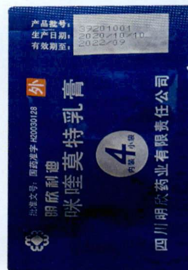
Imiquimod Cream-Mikuimote Rugao 0.25g [as reflected in the package insert] by: Sichuan Med-Shine Pharmaceutical Co., Ltd.