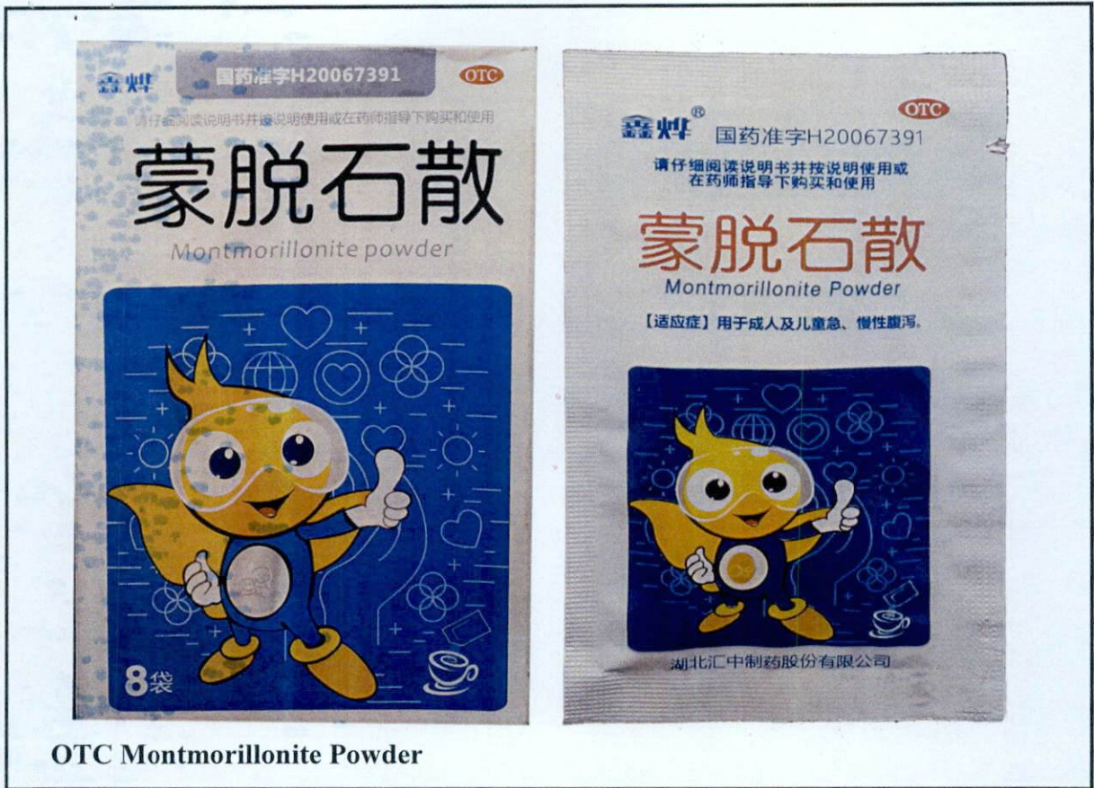
OTC Montmorillonite Powder