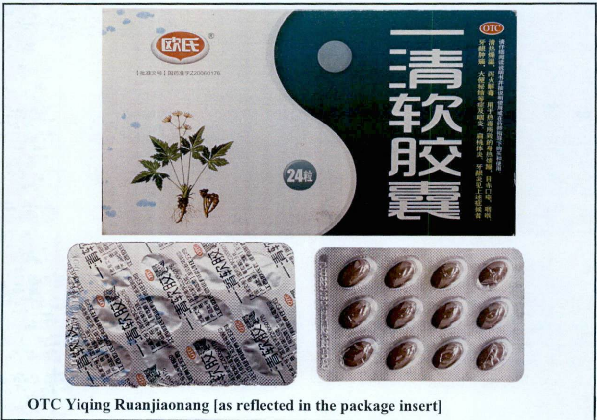
OTC Yiqing Ruanjiaonang [as reflected in the package insert]