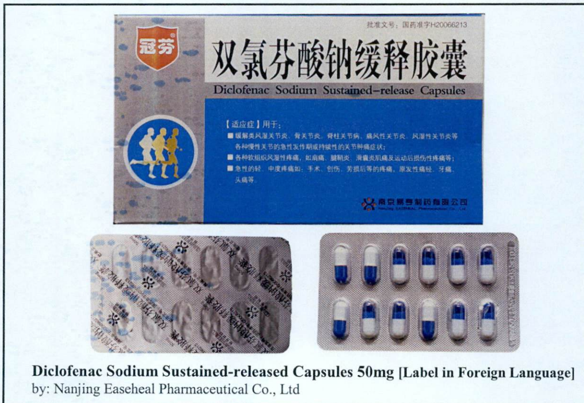
Diclofenac Sodium Sustained-released Capsules 50mg [Label in Foreign Language] by: Nanjing Easeheal Pharmaceutical Co., Ltd

The Food and Drug Administration (FDA) advises the public against the purchase and use of the following unregistered drug products: