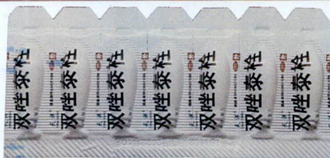
OTC Metronidazole, Clotrimazole and Chlorhexidine Acetate Suppositories Shuangzuotai Shuan [as reflected in the package insert]