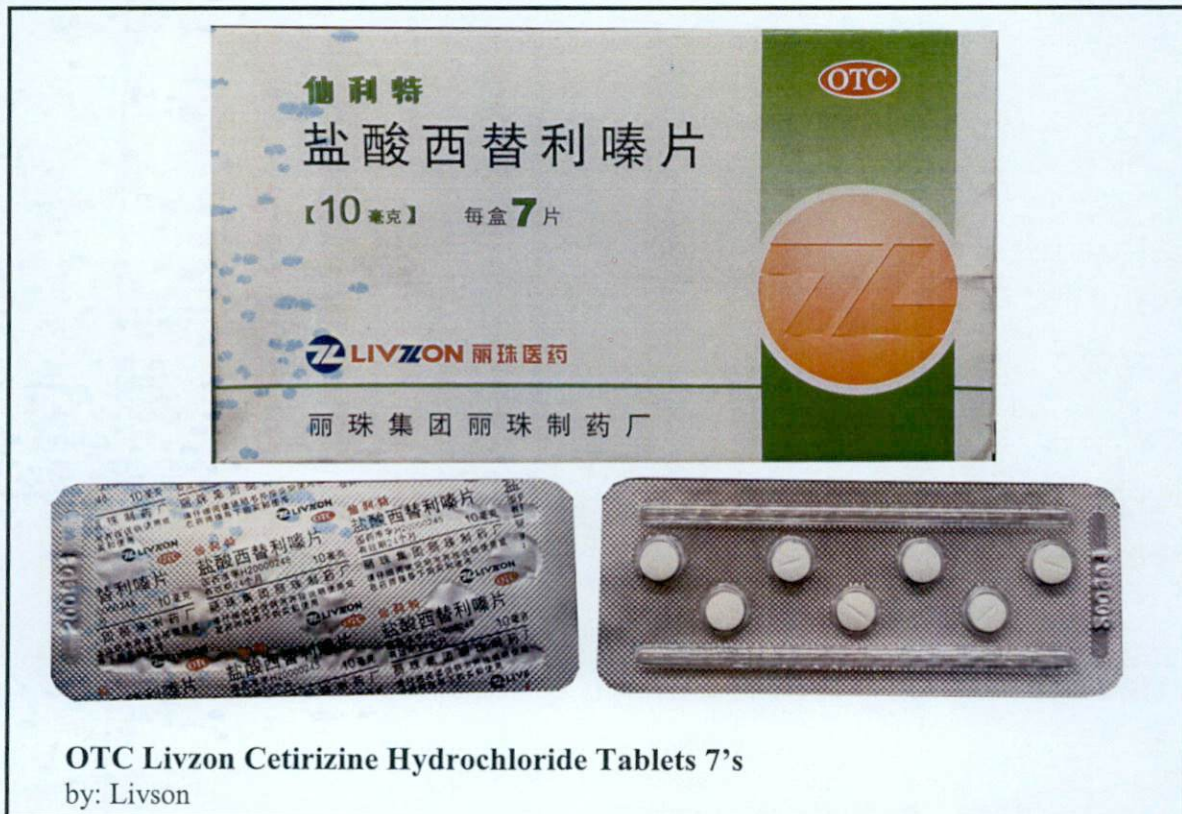
OTC Livzon Cetirizine Hydrochloride Tablets 7's by: Livzon

The Food and Drug Administration (FDA) advises the public against the purchase and use of the following unregistered drug products: