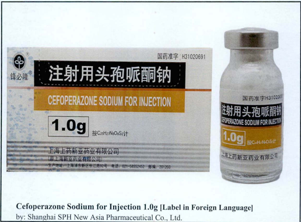
Cefoperazone Sodium for Injection 1.0g [Label in Foreign Language] by: Shanghai SPH New Asia Pharmaceutical Co., Ltd.