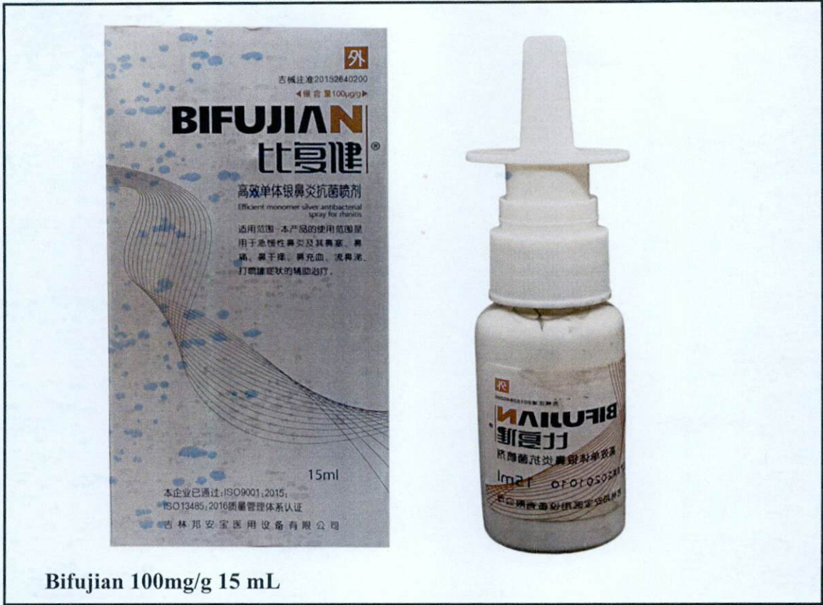
Bifujian 100mg/g 15 mL