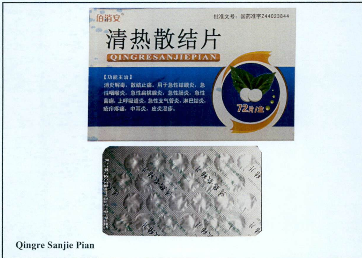
Qingre Sanjie Pian

The Food and Drug Administration (FDA) advises the public against the purchase and use of the following unregistered drug products: