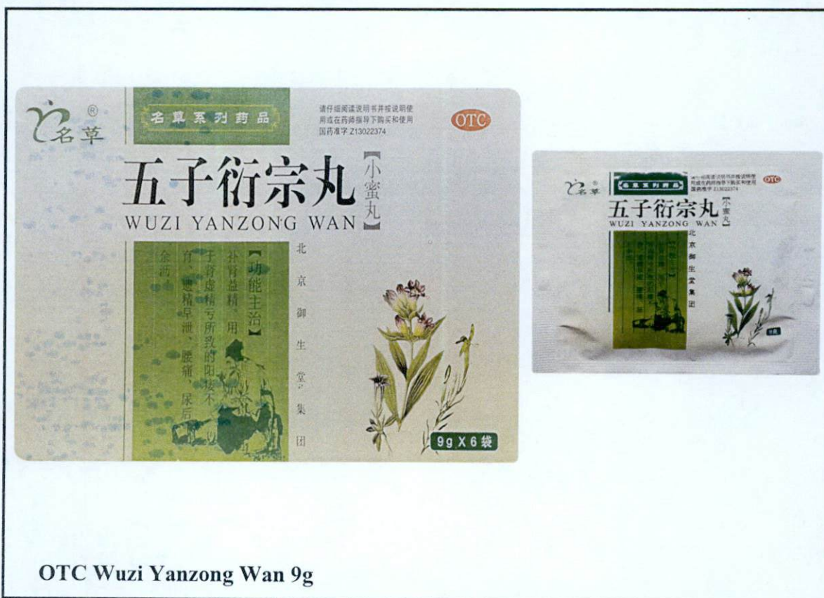
OTC Wuzi Yanzong Wan 9g

The Food and Drug Administration (FDA) advises the public against the purchase and use of the following unregistered drug products: