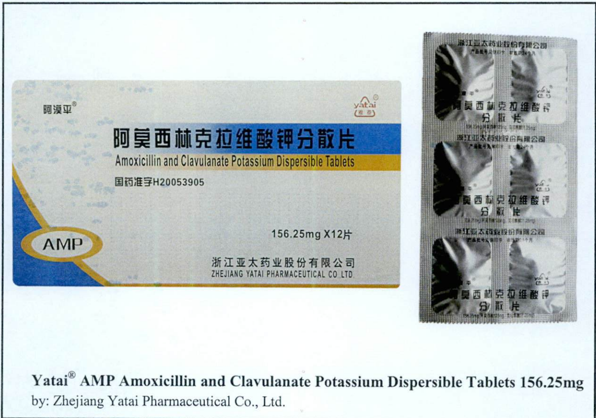
Yatai® AMP Amoxicillin and Clavulanate Potassium Dispersible Tablets 156.25mg by: Zhejiang Yatai Pharmaceutical Co., Ltd.