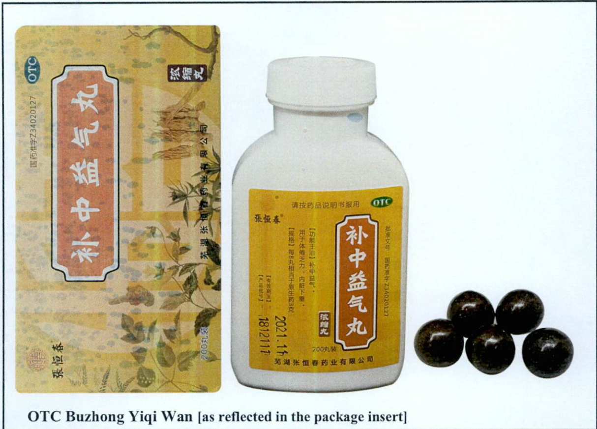
OTC Buzhong Yiqi Wan [as reflected in the package insert]