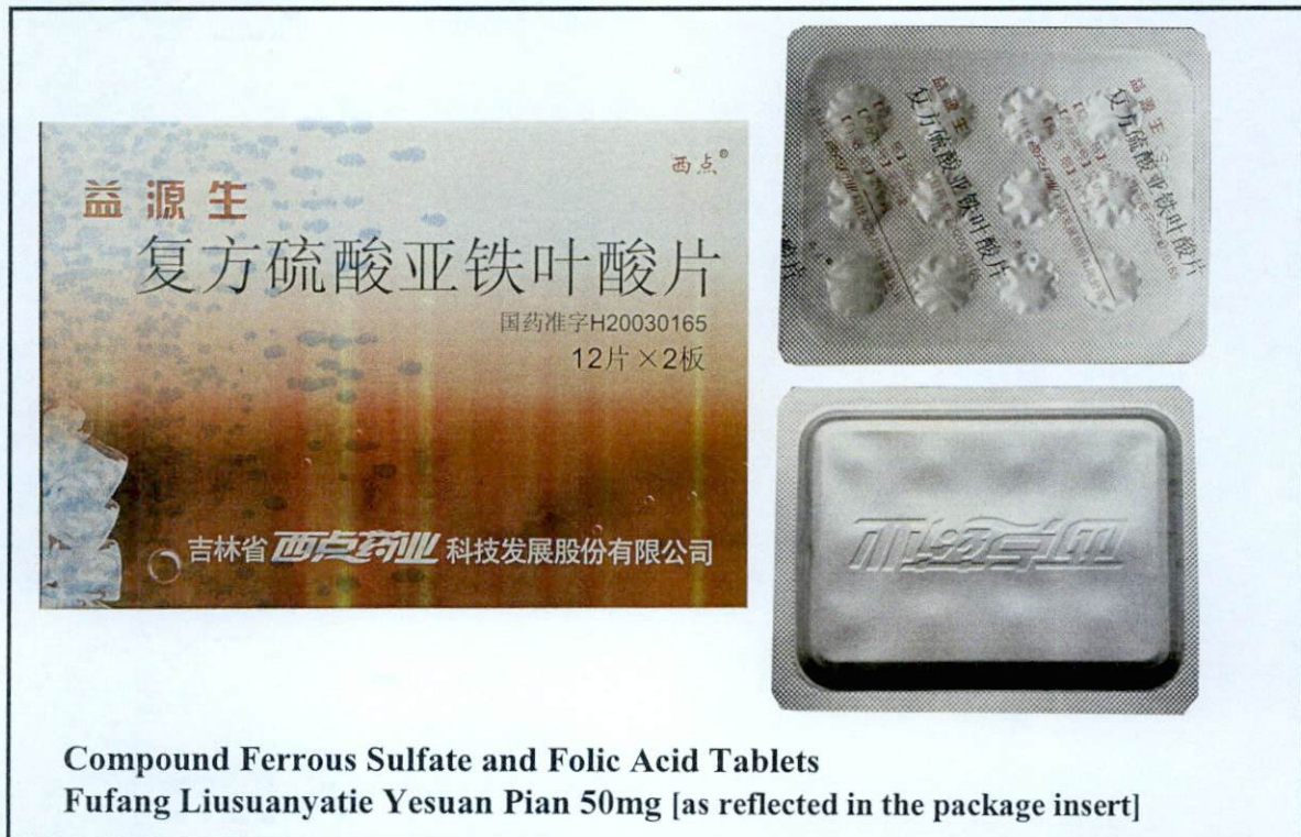
Compound Ferrous Sulfate and Folic Acid Tablets Fufang Liusuanyatie Yesuan Pian 50mg [as reflected in the package insert]

The Food and Drug Administration (FDA) advises the public against the purchase and use of the following unregistered drug products: