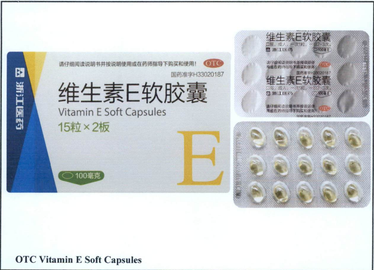
OTC Vitamin E Soft Capsules