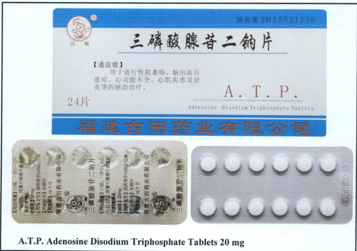
A.T.P. Adenosine Disodium Triphosphate Tablets 20 mg