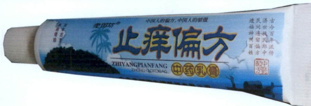
Zhiyangpianfang Zhongyaorugao 15g