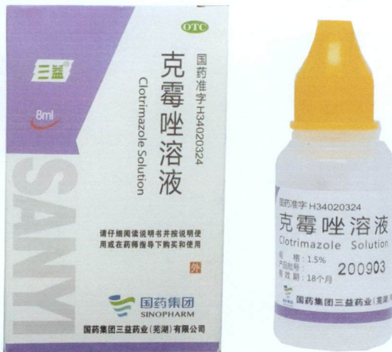
OTC Sanyi Clotrimazole Solution 8ml by: Sinopharm Sanyi