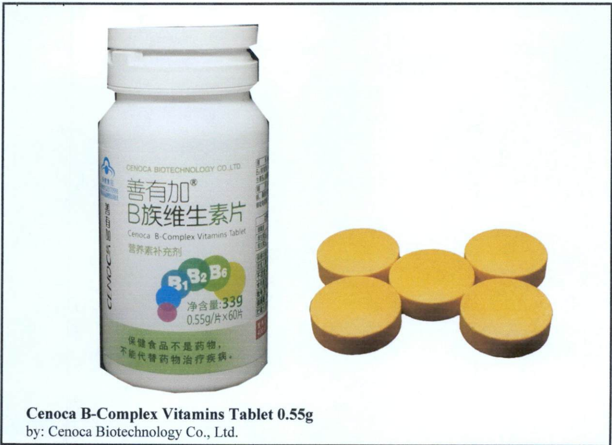
Cenoca B-Complex Vitamins Tablet 0.55g by: Cenoca Biotechnology Co., Ltd.