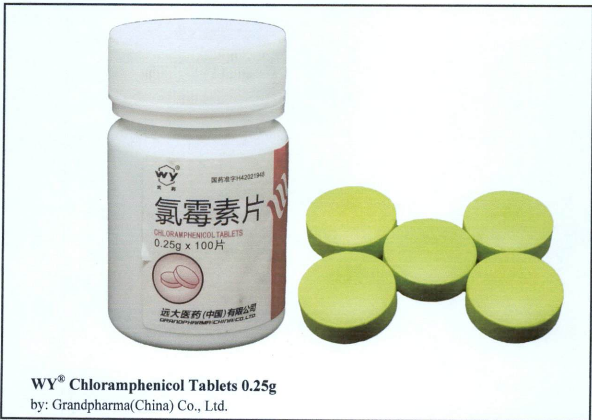
WY® Chloramphenicol Tablets 0.25g by: Grandpharma(China) Co., Ltd.