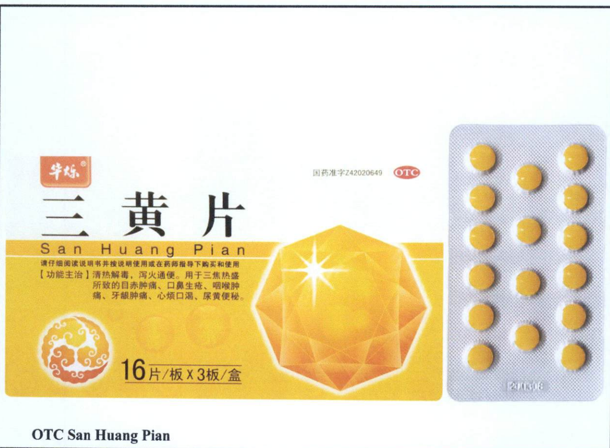
OTC San Huang Pian