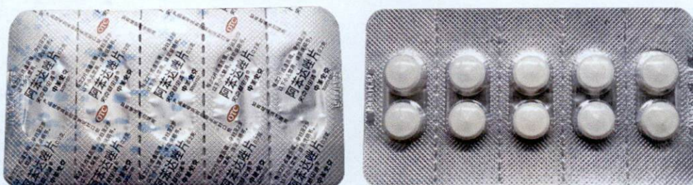
OTC ZENTEL® Albendazole Tablets 0.2g 10's by: Sino-American Tianjin SmithKline and French Lab., Ltd.