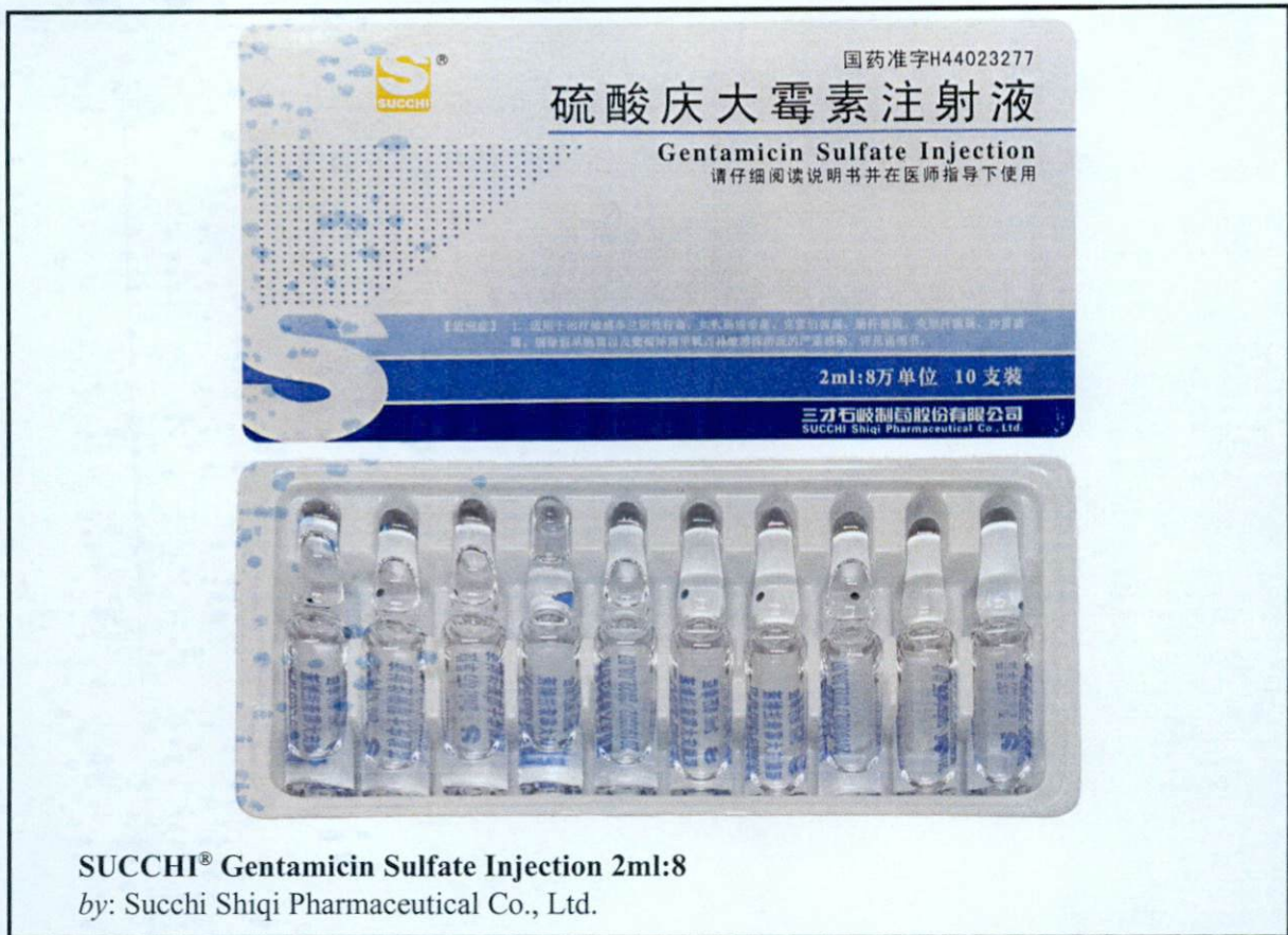
SUCCHI® Gentamicin Sulfate Injection 2ml:8 by: Succhi Shiqi Pharmaceutical Co., Ltd.