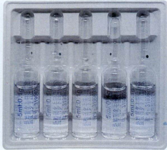
Yansuan Liduokayin Zhusheye 5ml:0.1g