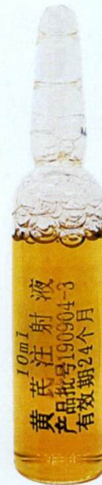
XINYAXILE® Huangqi Zhusheye 10ml by: Shanghai Xinya Pharmaceutical Gaoyou Co., Ltd.