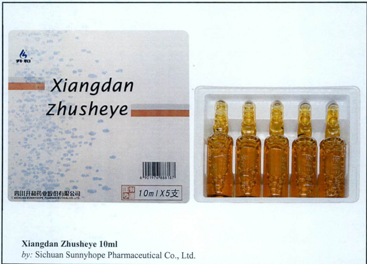
Xiangdan Zhushenye 10ml by: Sichuan Sunnyhope Pharmaceutical Co., Ltd.