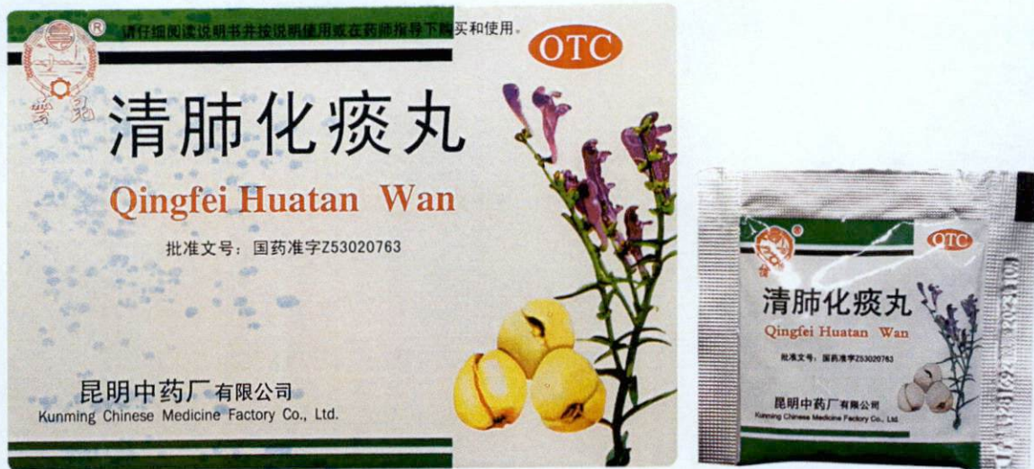
OTC Qingfei Huatan Wan by: Kunming Chinese Medicine Factory Co., Ltd.