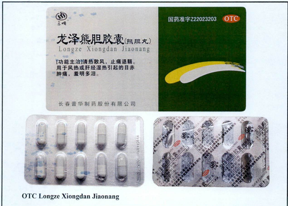
Figure 5. Unregistered drug product