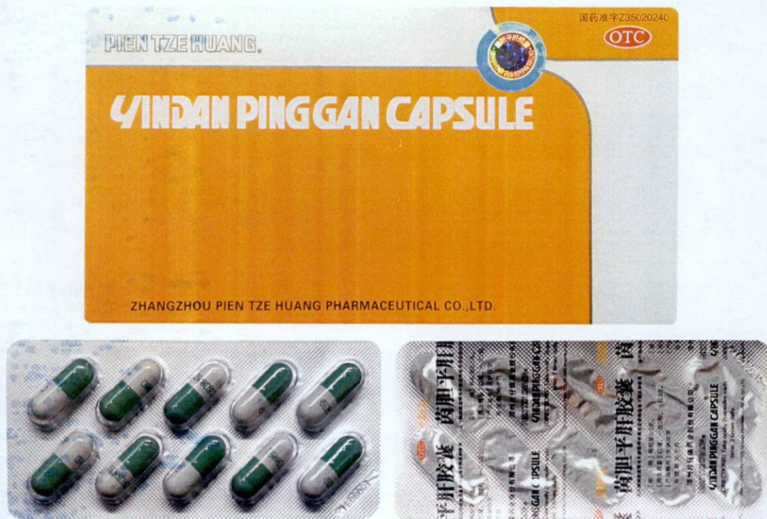
OTC Pien Tze Huang® Yindan Pinggan Capsule by: Zhangzhou Pien Tze Huang Pharmaceutical Co., Ltd.