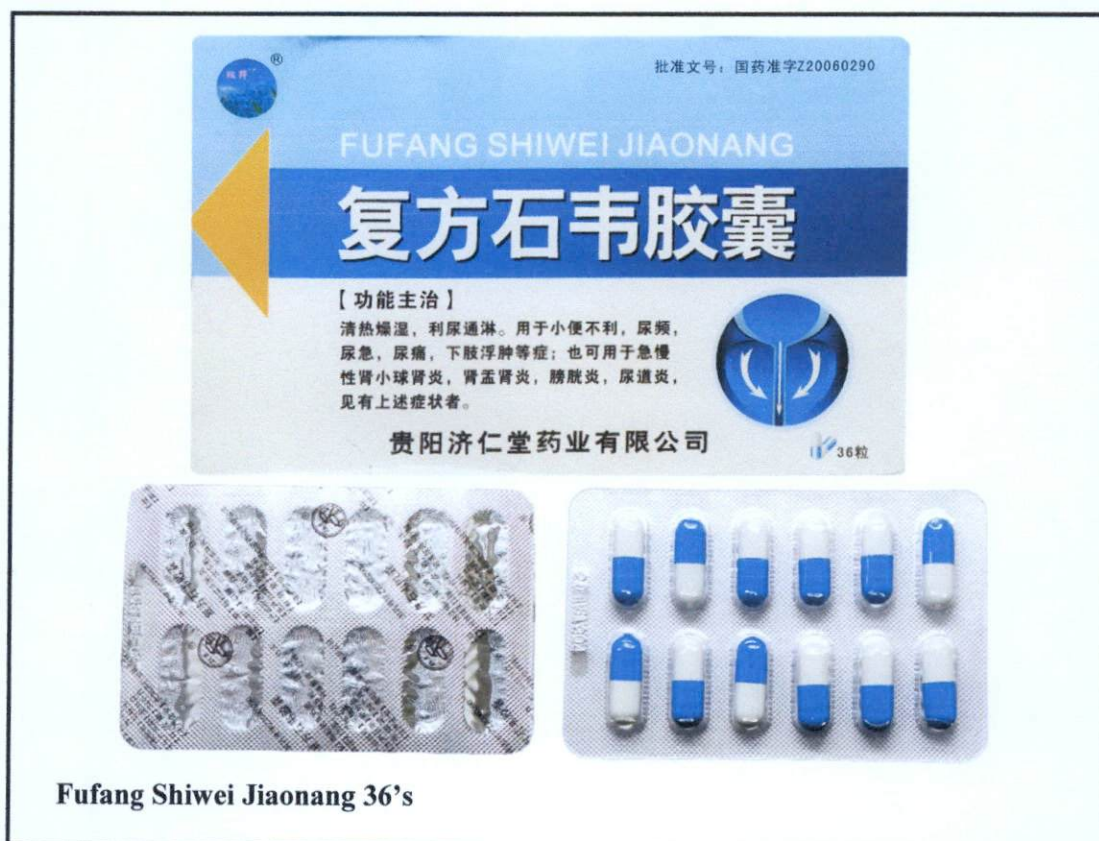
Fufang Shiwei Jiaonang 36's

The Food and Drug Administration (FDA) advises the public against the purchase and use of the following unregistered drug products: