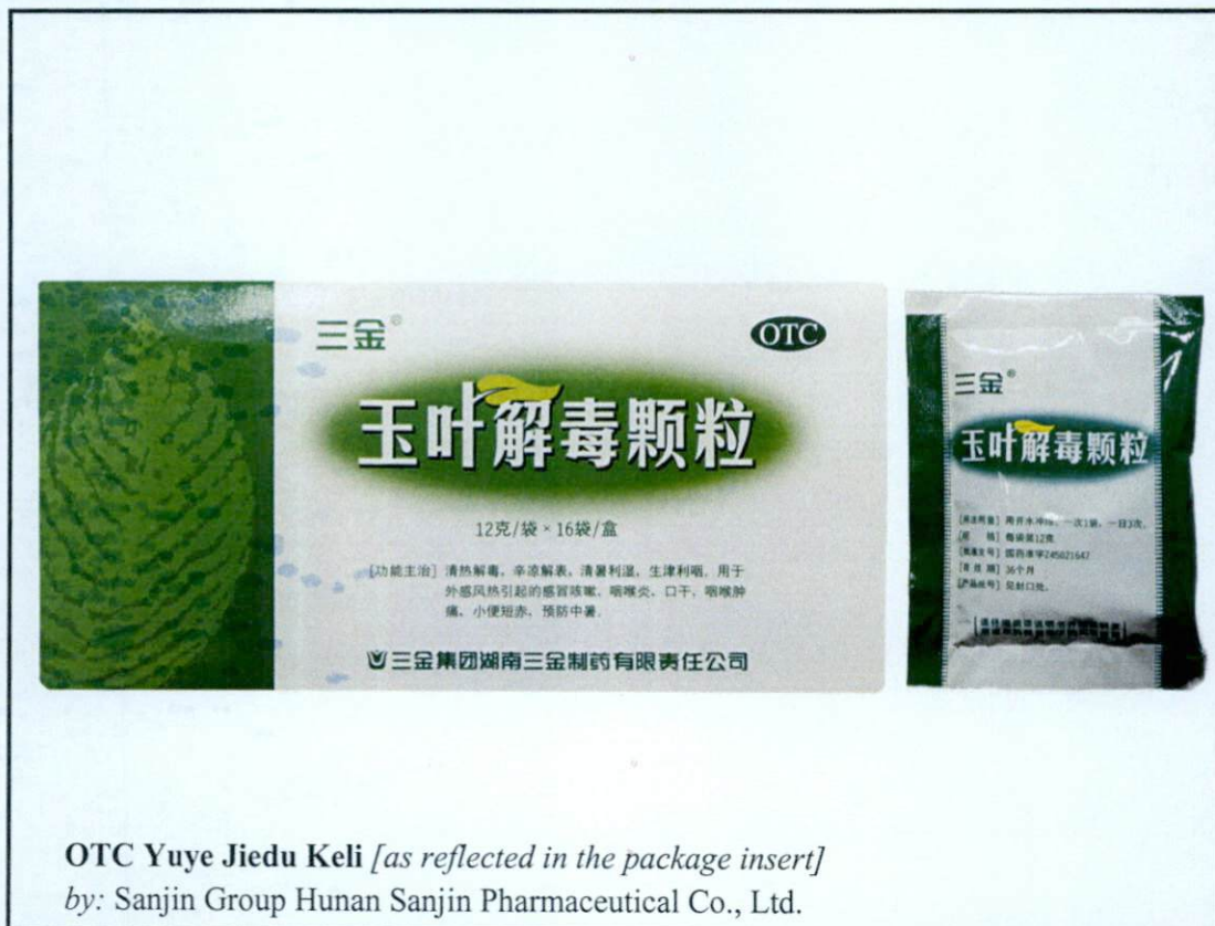
OTC Yuye Jiedu Keli [as reflected in the package insert] by: Sanjin Group Hunan Sanjin Pharmaceutical Co., Ltd.

The Food and Drug Administration (FDA) advises the public against the purchase and use of the following unregistered drug products: