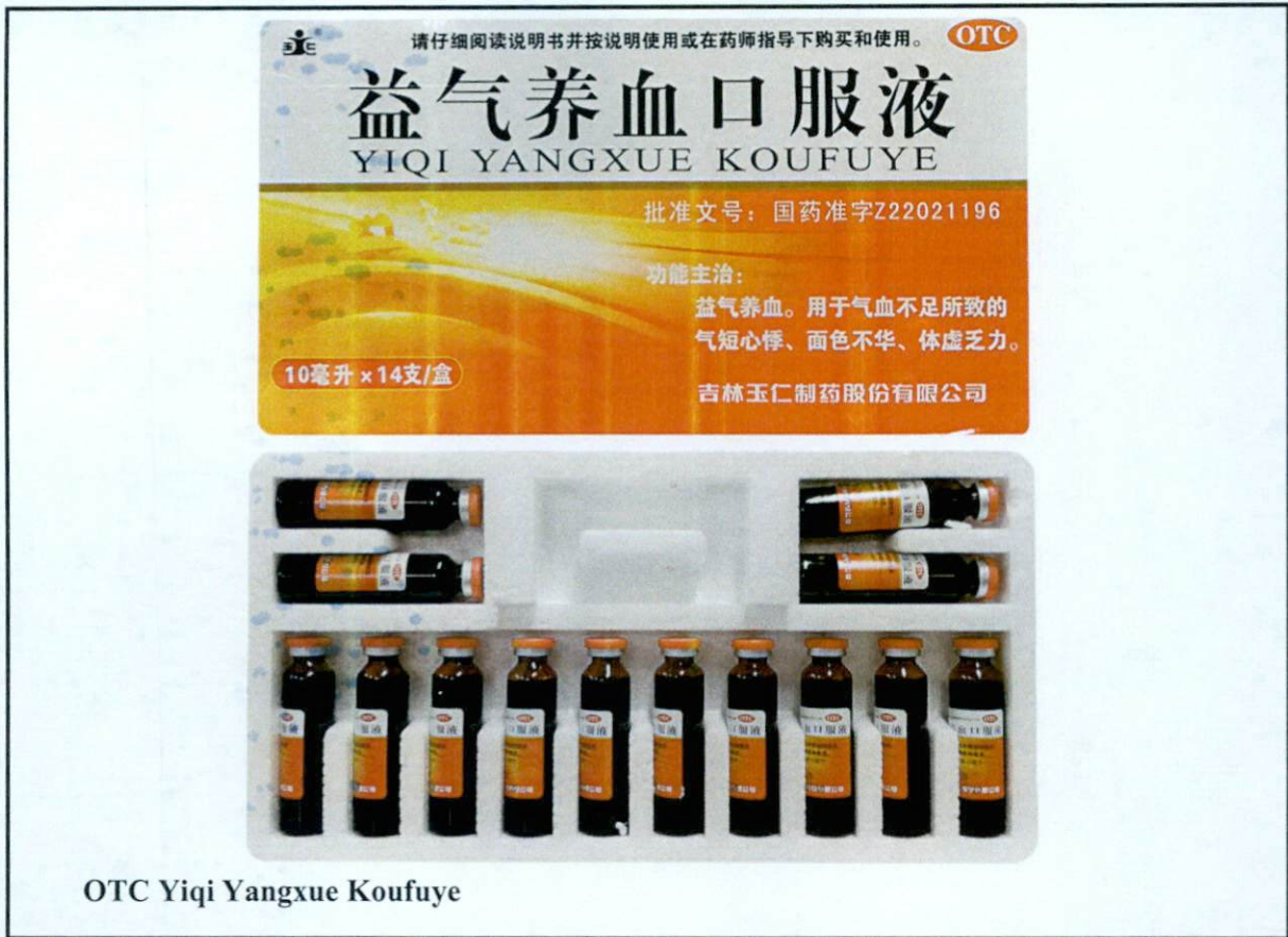
OTC Yiqi Yangxue Koufuye