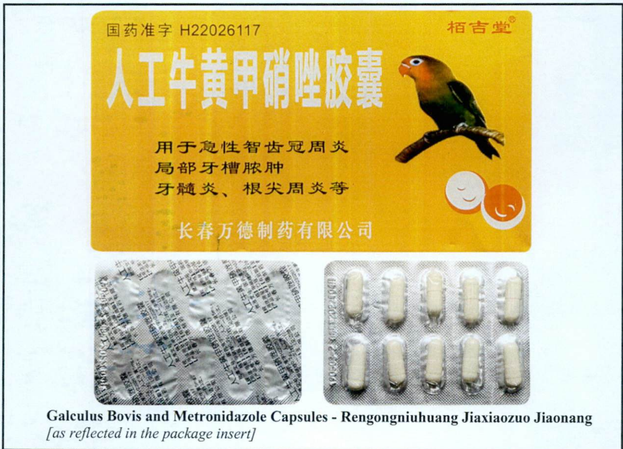
Figure 5. Unregistered drug product