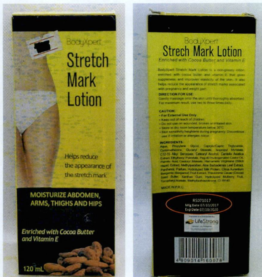
Figure 1. Counterfeit BODYXPERT STRETCH MARK LOTION ENRICHED WITH COCOA BUTTER AND VITAMIN E

In furtherance to FDA Advisory No. 2021-1017 "Public Health Warning Against the Purchase and Use of the Non-Compliant Cosmetic Product "BODYXPERT STRETCH MARK LOTION ENRICHED WITH COCOA BUTTER AND VITAMIN E" dated 14 May 2021, the Food and Drug Administration (FDA) reiterates its advice to the public against the purchase and use of the cosmetic product, BODYXPERT STRETCH MARK LOTION ENRICHED WITH COCOA BUTTER AND VITAMINE E. (Refer to image below)