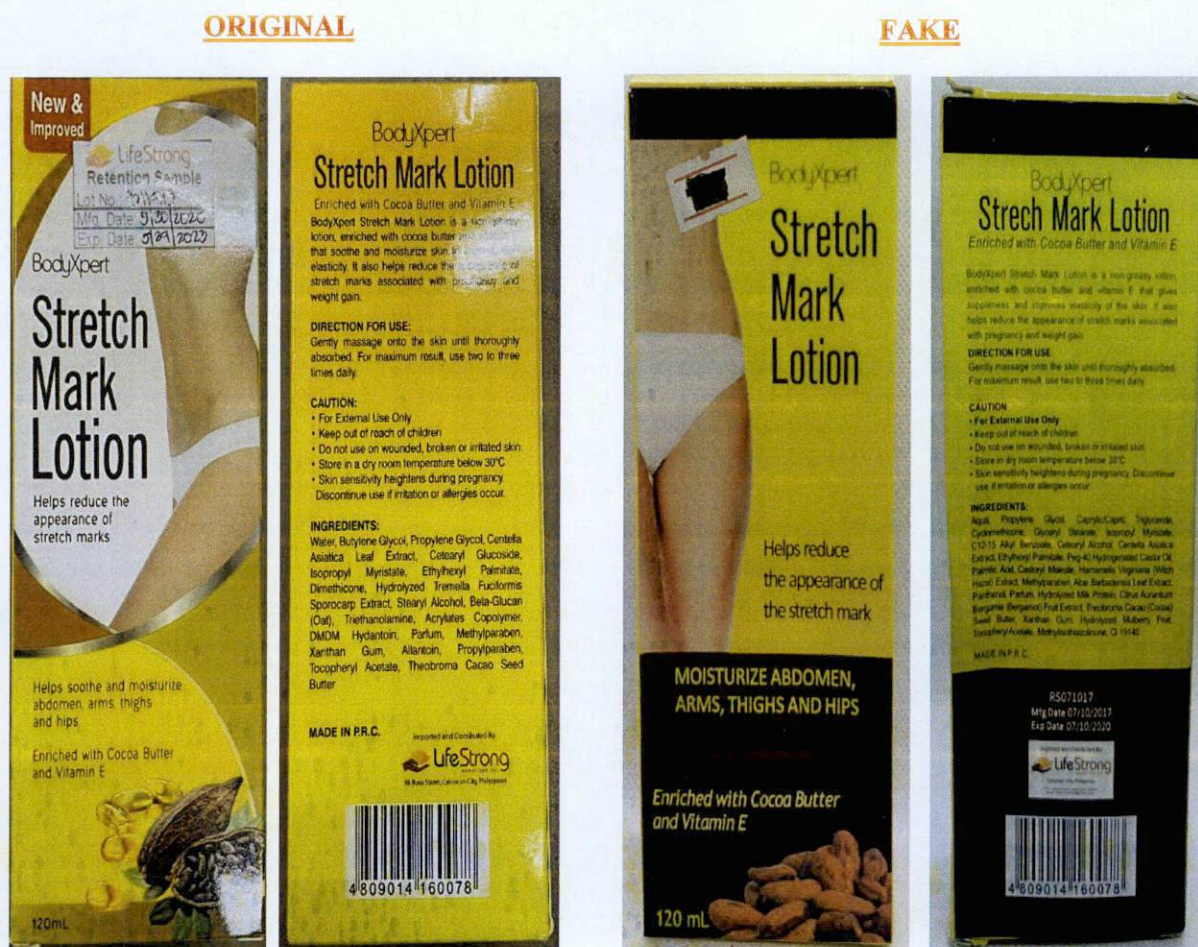
Figure 2. Comparison of the Authentic vs. the Counterfeit product

The FDA has coordinated with the Market Authorization Holder (MAH), Lifestrong Marketing Inc., and has verified that the aforementioned cosmetic product is COUNTERFEIT . According to the company, Lifestrong Marketing Inc., the LOT No. RS071017 does not belong to any batches of products that they distributed, released, and sold to their consumers/sellers that same year and thereafter.