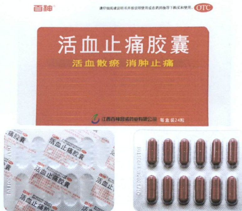
OTC Huoxue Zhitong Jiaonang [as reflected in the package insert] by: Jiangxi Baishen Changnuo Medicine Co., Ltd.