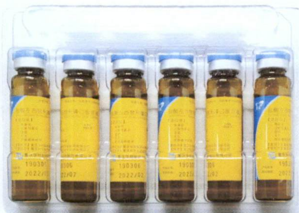
Levocetirizine Hydrochloride Oral Solution 0.05% by: Chongqing Huapont Pharm Co., Ltd.