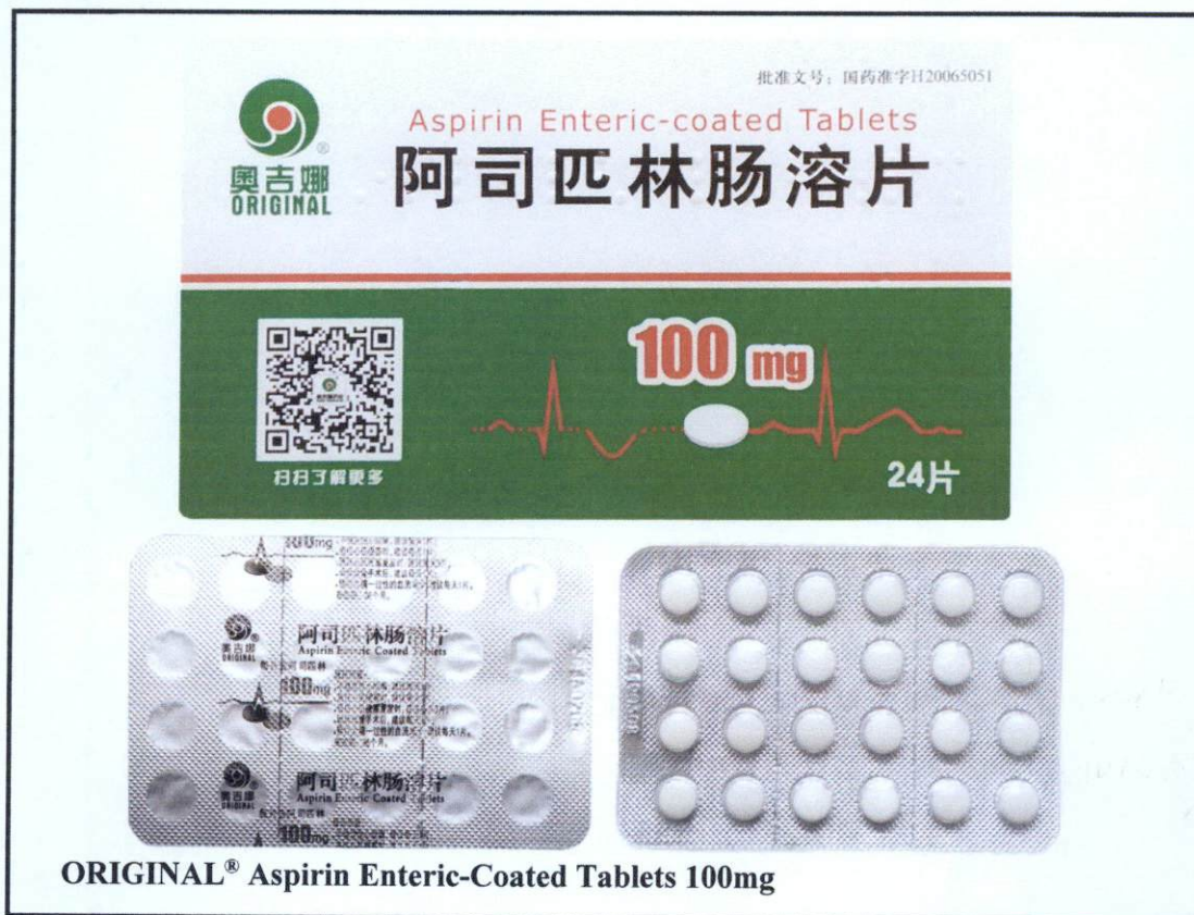
ORIGINAL® Aspirin Enteric-Coated Tablets 100mg

The Food and Drug Administration (FDA) advises the public against the purchase and use of the following unregistered drug products: