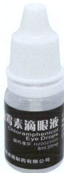
Chloramphenicol Eye Drops 8ml:20mg