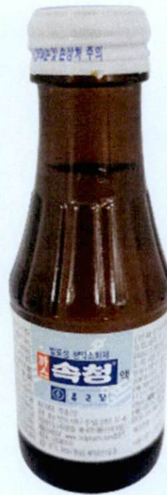
Figure 3. Unregistered Amber Bottle with White Label and Cap (In Foreign Language)