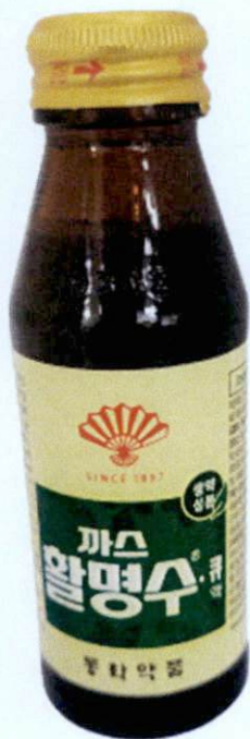
Figure 4. Unregistered Amber Bottler with Yellow and Green Label (In Foreign Language)