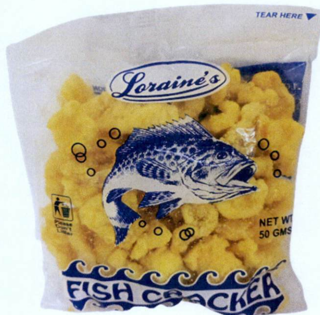
Figure 1. Unregistered LORAINE'S Fish Cracker

The Food and Drug Administration (FDA) warns all healthcare professionals and the general public NOT TO PURCHASE AND CONSUME the following unregistered food product and food supplements: