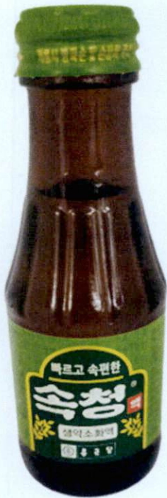
Figure 2. Unregistered Amber Bottle with Green Primary Label and Green Cap (In Foreign Language)