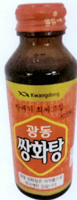
Figure 5. Unregistered KWANGDONG Amber Bottle with Red Label (In Foreign Language)