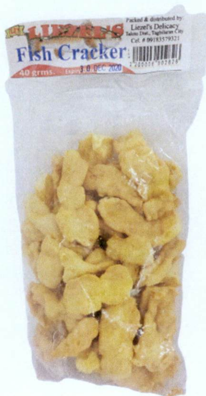
Figure 1. Unregistered LIEZEL'S Fish Cracker

The Food and Drug Administration (FDA) warns all healthcare professionals and the general public NOT TO PURCHASE AND CONSUME the following unregistered food products: