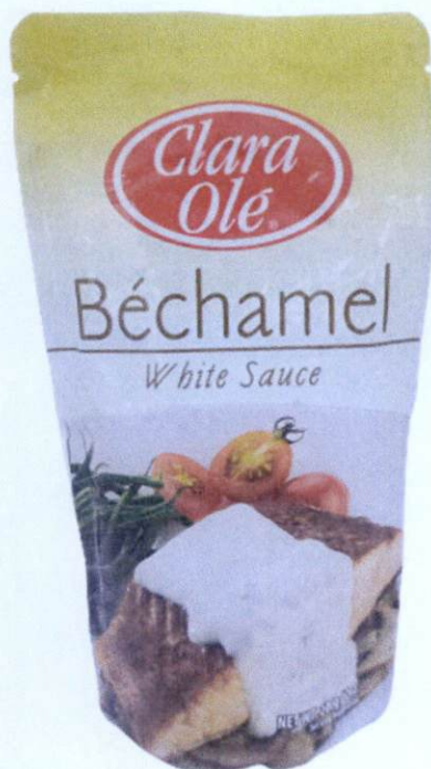
Figure 4. Unregistered CLARA OLE White Sauce Bechamel