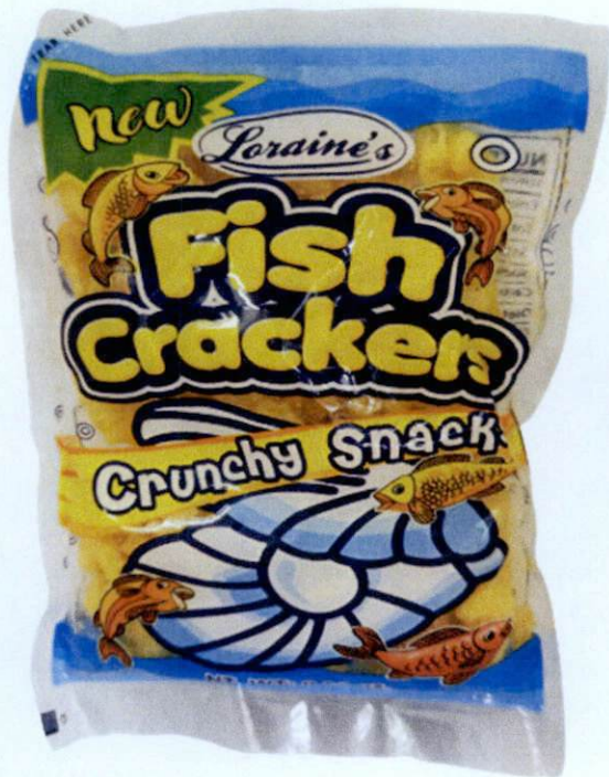
Figure 2. Unregistered NEW LORAINE'S Fish Crunchy Snacks