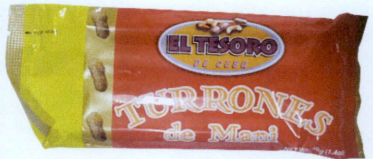
Figure 3. Unregistered EL TESORO DE CEBU Turrone de Mani