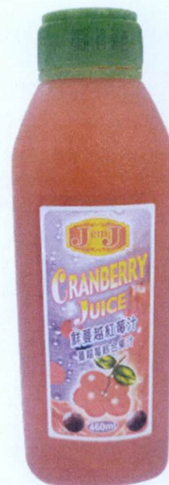
Figure 5. Unregistered JEM J Cranberry Juice