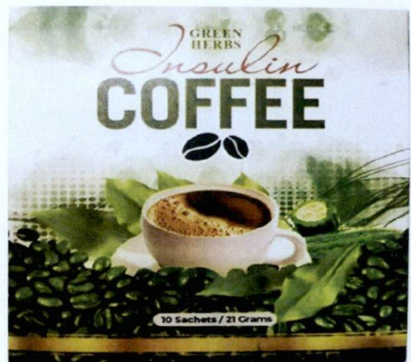
Figure 5. Unregistered GREEN HERBS Insulin Coffee