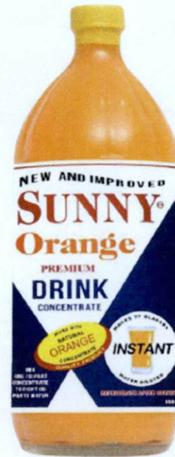
Figure 3. Unregistered SUNNY Orange Juice Premium Drink Concentrate