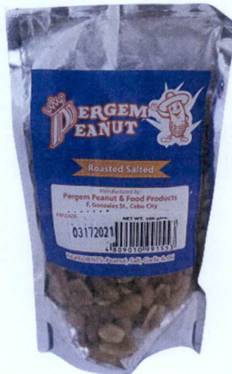
Figure 1. Unregistered PERGEM PEANUT Roasted Peanut Salted

The Food and Drug Administration (FDA) warns all healthcare professionals and the general public NOT TO PURCHASE AND CONSUME the following unregistered food products: