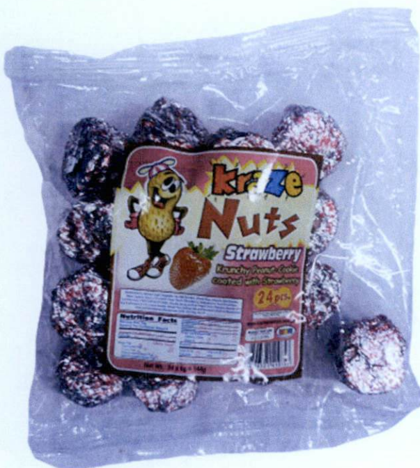
Figure 4. Unregistered KRAZE NUTS Krunchy Peanut Cookie Coated with Strawberry