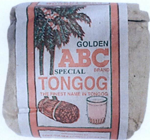
Figure 2. Unregistered GOLDEN ABC Special Tongog