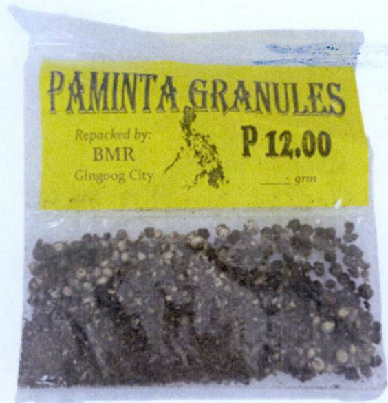
Figure 3. Unregistered UNBRANDED Paminta Granules