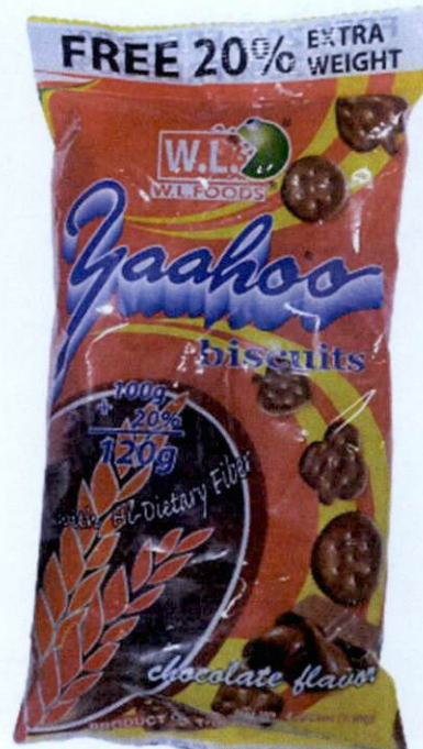
Figure 5. Unregistered WL Yahoo Biscuit Flavored Chips Chocolate Flavor