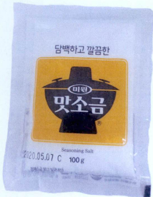
Figure 4. Unregistered UNBRANDED Seasoning Salt (In Foreign Language)