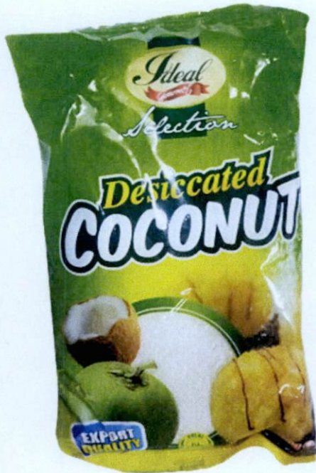
Figure 2. Unregistered IDEAL GOURMET SELECTION Desiccated Coconut