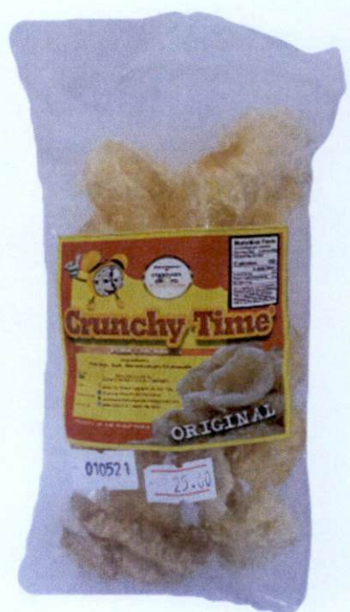
Figure 5. Unregistered CRUNCHY TIME Pork Chicon Original