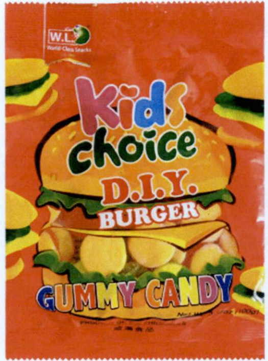
Figure 3. Unregistered WL KIDS CHOICE D.I.Y. Burger Gummy Candy