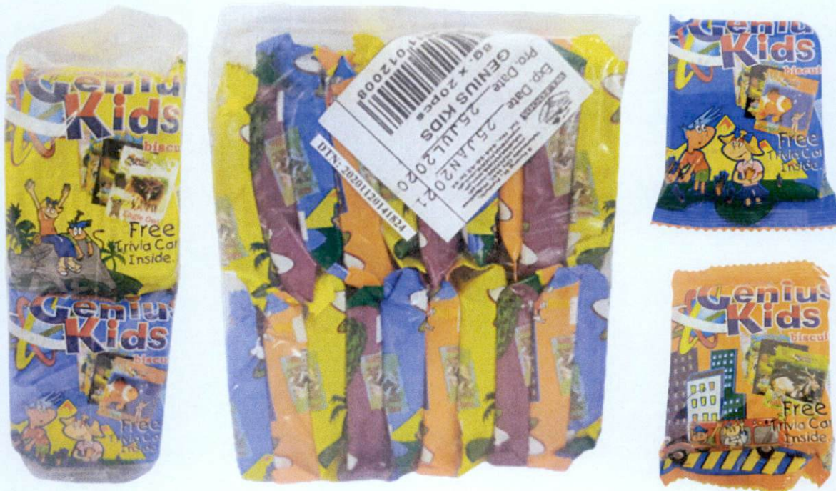
Figure 1. Unregistered WL FOODS Genius Kids Biscuit

The Food and Drug Administration (FDA) warns all healthcare professionals and the general public NOT TO PURCHASE AND CONSUME the following unregistered food products: