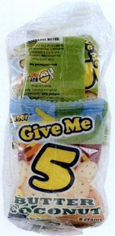
Figure 2. Unregistered COWBOY Give Me 5 Butter Coconut