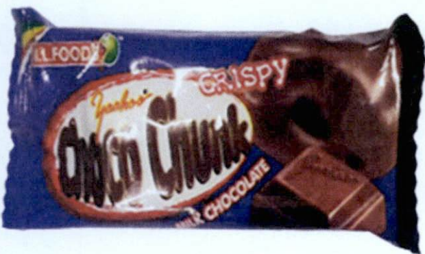
Figure 4. Unregistered YAHOO Choco Chunk Milk Chocolate