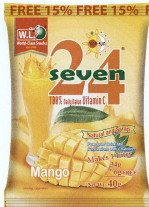
Figure 1. Unregistered 24 SEVEN Daily Vitamin C Mango Juice

The Food and Drug Administration (FDA) warns all healthcare professionals and the general public NOT TO PURCHASE AND CONSUME the following unregistered food products: