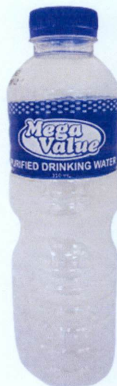
Figure 5. Unregistered MEGA VALUE Purified Drinking Water