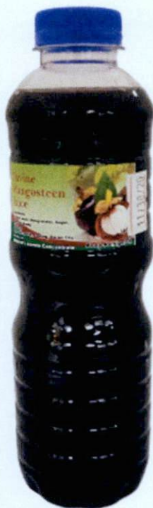
Figure 2. Unregistered DAVINE Mangosteen Juice