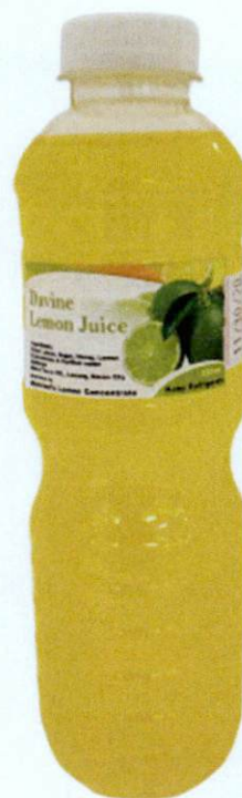
Figure 3. Unregistered DAVINE Lemon Juice