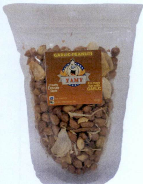
Figure 4. Unregistered YAMY Garlic Peanuts