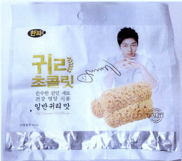
Figure 4. Unregistered The Common Oat Flavor in Plastic with White Label (In Foreign Language)