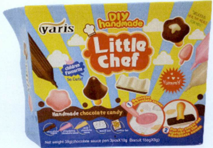
Figure 3. Unregistered YARIS LITTLE CHEF Handmade Chocolate Candy