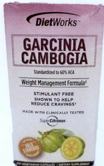
Figure 5. Unregistered DIETWORKS Garcinia Cambogia Dietary Supplement