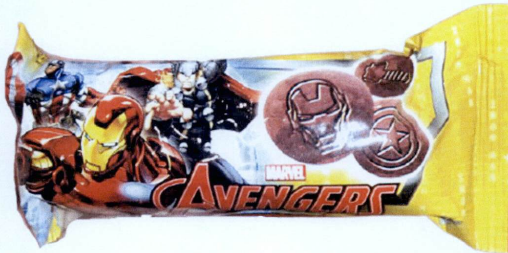
Figure 1. Unregistered JUJU MARVEL AVENGERS Chocolate Biscuits

The Food and Drug Administration (FDA) warns all healthcare professionals and the general public NOT TO PURCHASE AND CONSUME the following unregistered food product and food supplements: