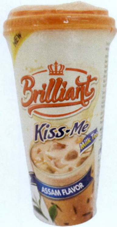
Figure 2. Unregistered BRILLIANT KISS ME Milk Tea Assam Flavor