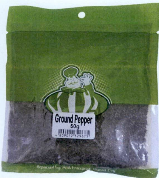
Figure 4. Unregistered UNBRANDED Ground Pepper