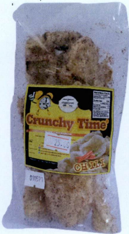
Figure 2. Unregistered CRUNCHY TIME Pork Chicharon Original Chili