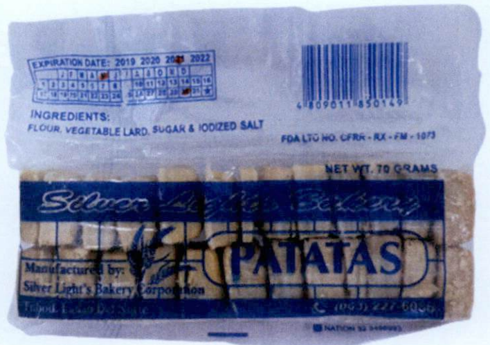
Figure 3. Unregistered SILVER LIGHTS Bakery Patatas