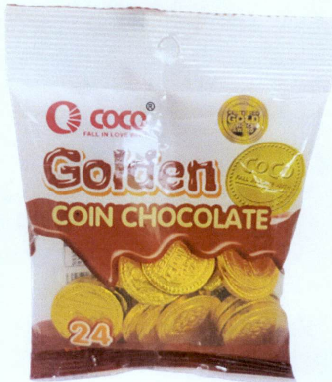
Figure 1. Unregistered COCO FALL IN LOVE Golden Coin Chocolate

The Food and Drug Administration (FDA) warns all healthcare professionals and the general public NOT TO PURCHASE AND CONSUME the following unregistered food products and food supplement: