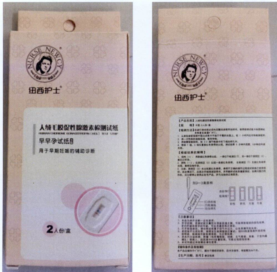
Figure 1. Unregistered HCG Test Strip (in foreign characters)

The Food and Drug Administration (FDA) warns all healthcare professionals and the general public NOT TO PURCHASE AND USE the unregistered medical device product: