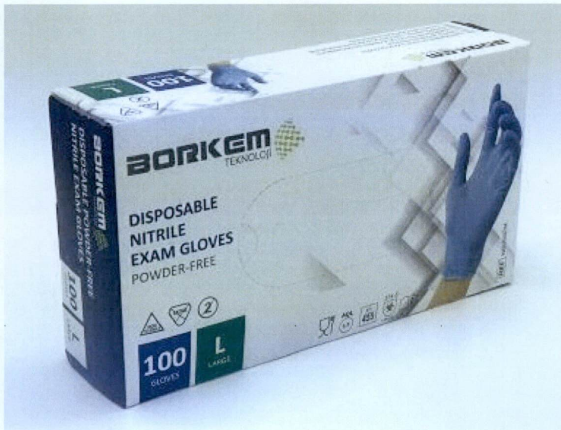
Figure 1. Unnotified Borkem Teknoloji Disposable Nitrile Exam Gloves

The Food and Drug Administration (FDA) warns all healthcare professionals and the general public NOT TO PURCHASE AND USE the unnotified medical device product: